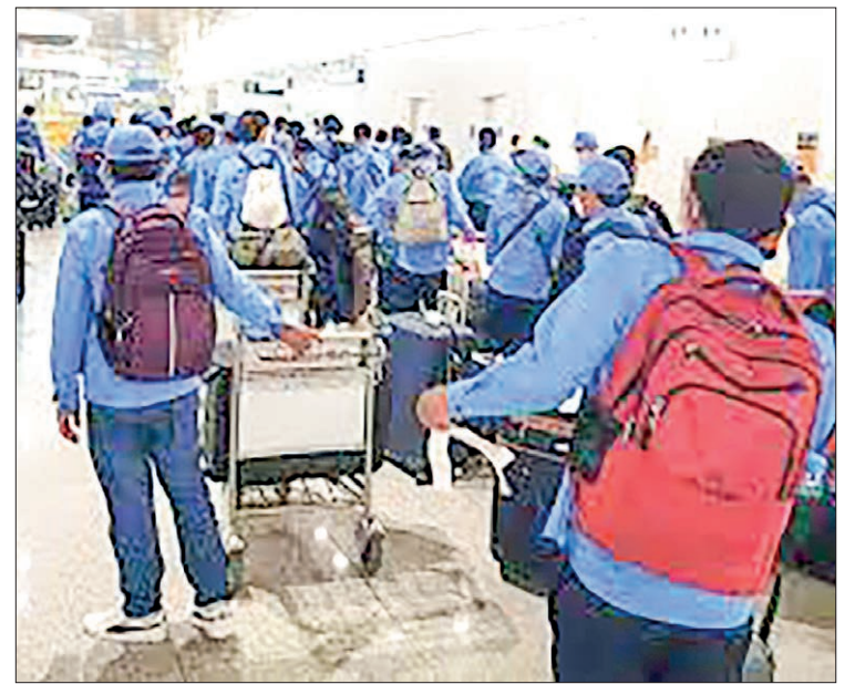
Some Myanmar workers who officially migrate to work in Japan.

It verifies whether labour supervisory company and factories or companies which offered jobs in Japan are officially established or not, and re-submits its findings and remarks to the Ministry of Labour through the Ministry of Foreign Affairs. — MT/ZS