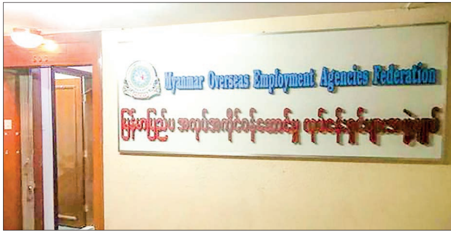
The image shows the office of the Myanmar Overseas Employment Agencies Federation.

"The most important thing is to go directly to the agency's office. Safe Migration has published the list and names of licensed agencies. After checking the list, they should go directly to the offices, whether they are real or not. If the company exists, they should also verify phone numbers. Sometimes, the name of a licensed company found online is correct, but