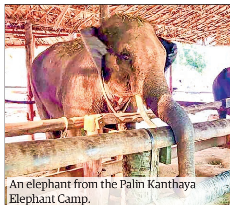
An elephant from the Palin Kanthaya Elephant Camp.

"We have provided vaccination for elephants on a regular basis and fed them necessary supplements. We have provided healthcare services for them. Elephant camps are open in Nay Pyi Taw, Taunggyi,