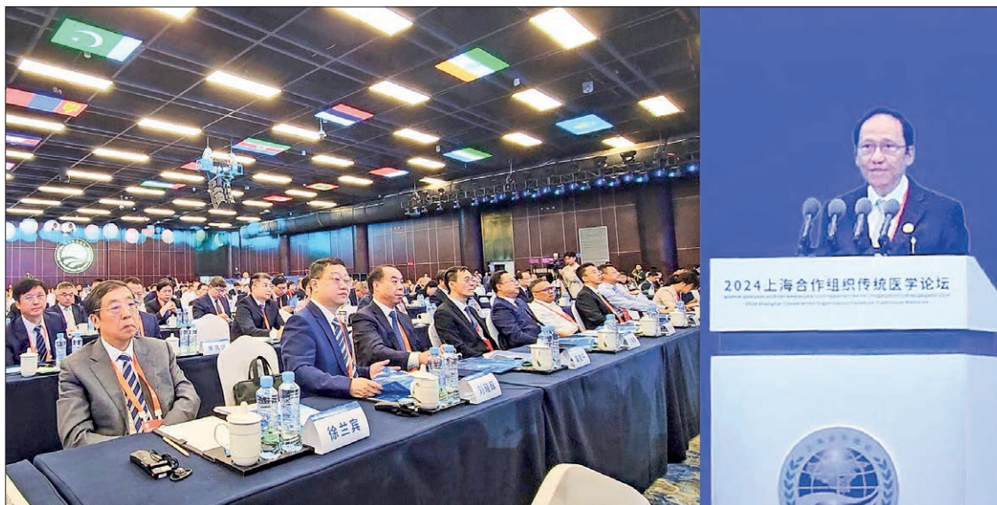
Union Minister Dr Thet Khaing Win addresses the opening session of the 2024 Shanghai Cooperation Organization Forum on Traditional Medicine on 27 June 2024.

THE Myanmar delegation led by Union Minister for Health Dr Thet Khaing Win attended the Health Minister-level meeting of the 2024 Shanghai Cooperation Organization on the evening of 26 June in Nanchang of Jiangxi, China. The delegation also participated in the dinner reception in honour of the 2024 Shanghai Cooperation Organization Forum on Traditional Medicine.