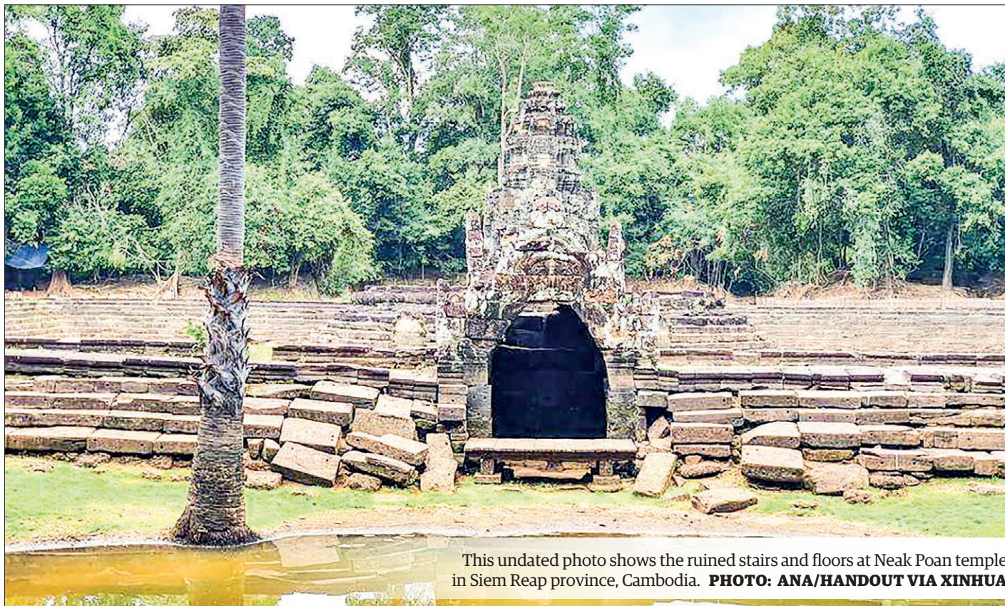
This undated photo shows the ruined stairs and floors at Neak Poan temple in Siem Reap province, Cambodia.