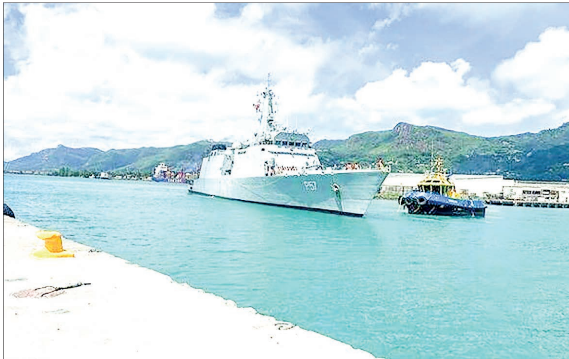
Indian Naval Ship (INS) Sunayna recently arrived at Port Victoria, Seychelles, as part of its extended deployment in the South Western Indian Ocean Region.

teractions, engagements with the Seychelles Defence Force, special yoga sessions, ships open to visitors, and community outreach programmes are scheduled. An aerial demonstration of the indigenously built Naval ALH is also planned during the port call.