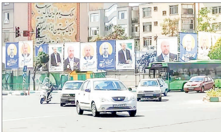
The voting will be held at close to 59,000 polling stations in more than 95 states, and over 61 million people are eligible to vote in the election, according to authorities.

Iran's 14 th presidential election, initially set for 2025, was rescheduled following Raisi's unexpected death. Initially, six candidates — Amir-Hossein Ghazizadeh Hashemi, the current vice-president; Alireza Zakani, the mayor of Tehran; Mohammad Baqer Qalibaf, the parliamentary speaker; Saeed Jalili, the former top negotiator for nuclear talks; Mostafa Pourmohammadi, a former interior minister and justice minister; and Masoud Pezeshkian, a former health minister — were qualified to enter the race. — Xinhua