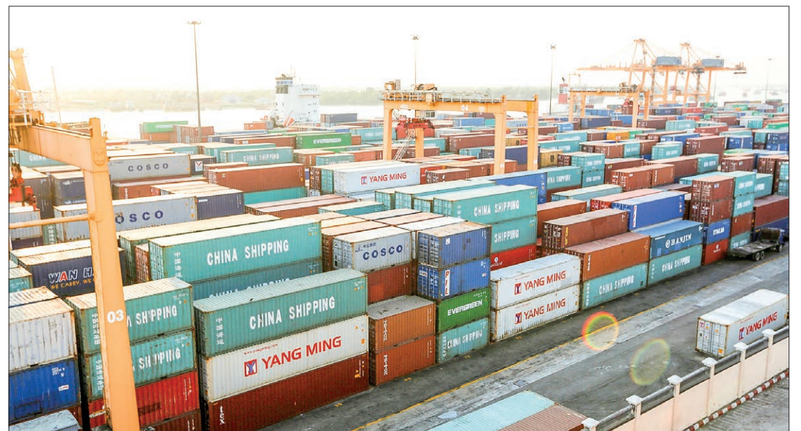
File photo shows the container yard and its terminals at Yangon Port.

gmail.com and to the UMFC-CI via 01 2314344-49 Ext (464) and email ma@umfcci.com.mm. — NN/KK