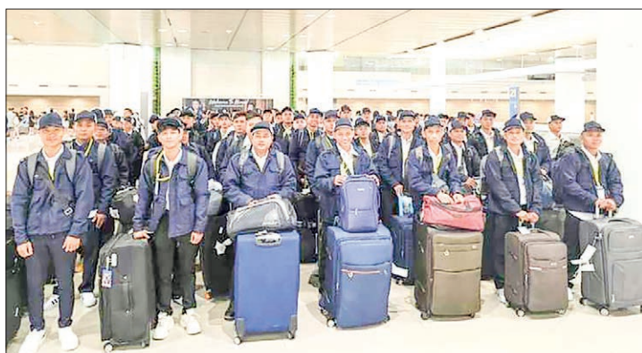
Myanmar EPS workers seen arriving at Incheon International Airport on 25 June.

the Myanmar Embassy in Seoul welcomed the workers, advised them on what they should do,