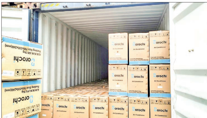
Confiscated illegal items in different regions and states.

Thus, the Anti-Illegal Trade Steering Committee reported 13 arrests on 26 and 27 June with an estimated value of K747,413,387. — MNA/KZL