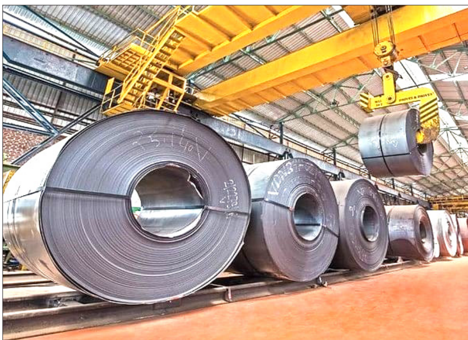
JSW Steel Limited is an Indian multinational steel producer based in Mumbai.

The cement production which weight: 5.37 per cent, declined by 0.8 per cent in May, over May last year. Its cumulative index