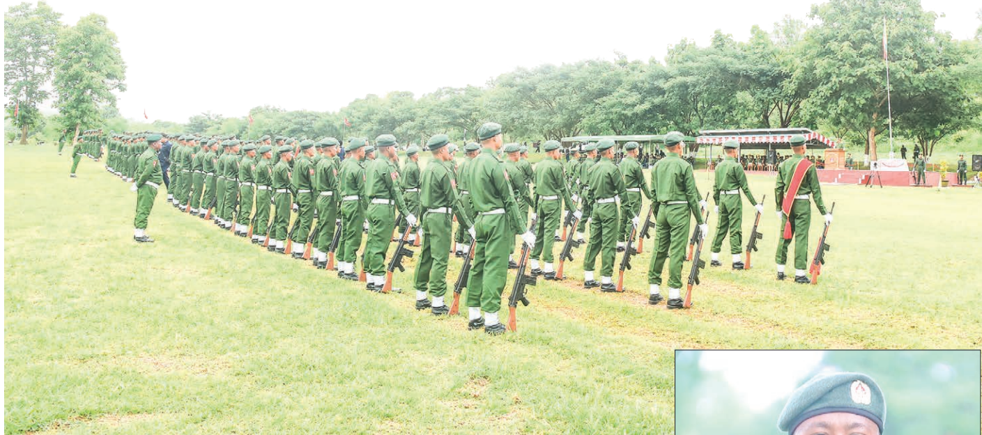
Photos (clockwise) show the passing out parade of the People's Military Servants Training 1 and graduates expressing their voices.

THE passing out parades for Military the People's Military Servants Training 1 were held on the morning of 28 June at the relevant local training schools, as per the respective military commands.