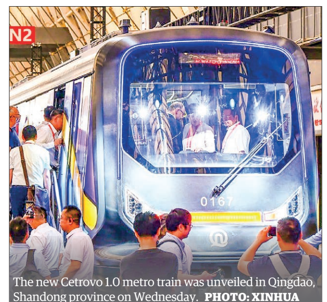
The new Centrovo 1.0 metro train was unveiled in Qingdao, Shandong province on Wednesday. PHOTO: XINHUA

The metro train has completed in-factory testing and is slated to commence operations in Qingdao later this year. — Xinhua