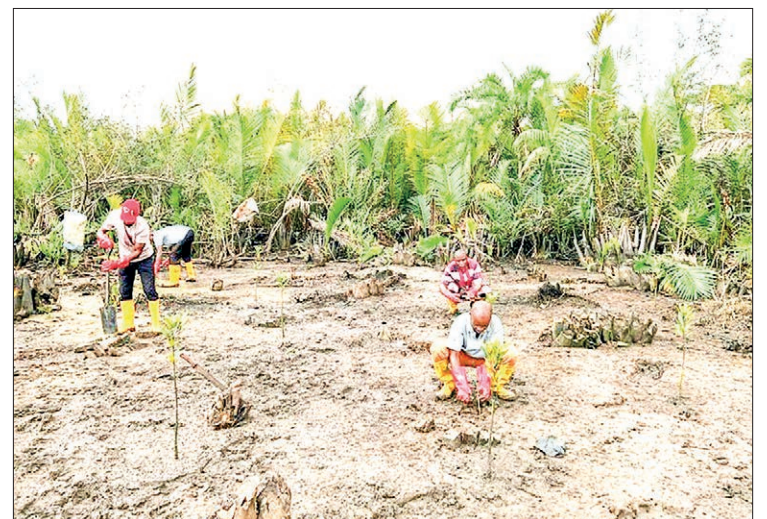
Nigeria’s government has promised to help local authorities protect mangroves. PHOTO: AFP

Mangrove forests are a biodiversity paradise. The specialist saltwater trees’ huge root networks provide nurseries for juvenile fish, which are crucial to supporting stocks. — AFP