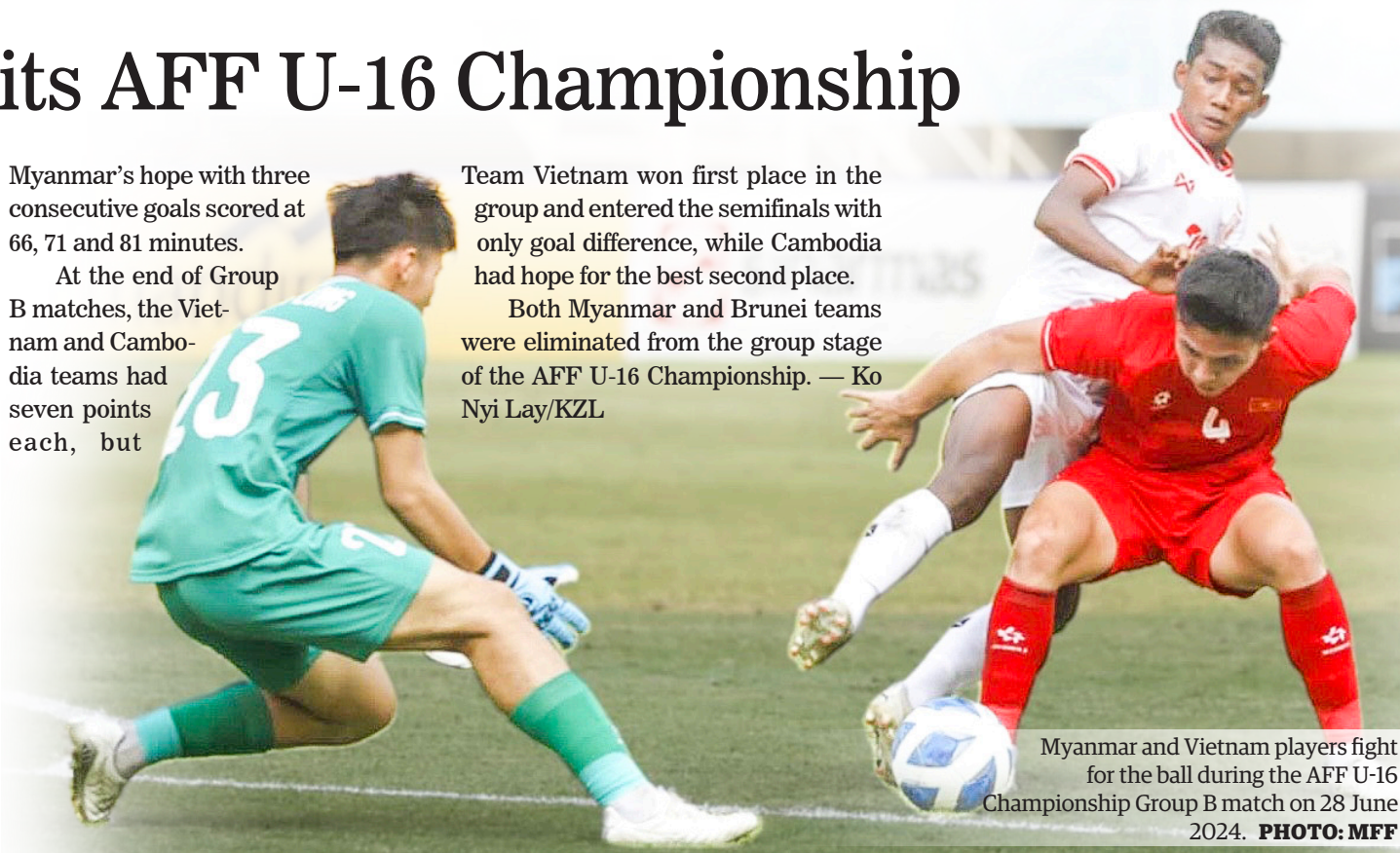
Myanmar and Vietnam players fight for the ball during the AFF U-16 Championship Group B match on 28 June 2024.

Both Myanmar and Brunei teams were eliminated from the group stage of the AFF U-16 Championship. — Ko Nyi Lay/KZL