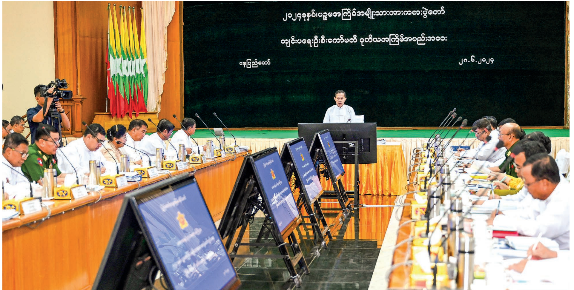
State Administration Council Vice-Chairman Deputy Prime Minister Vice-Senior General Soe Win addresses the second meeting of the Leading Committee on Organizing the Fifth National Sports Festival 2024 yesterday.