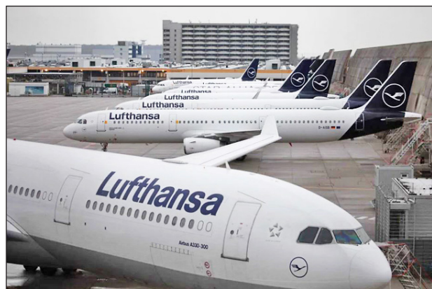
The extra cost will be added to all flights sold and operated by the group departing from EU countries as well as Britain, Norway and Switzerland.

GERMAN airline giant Lufthansa said Tuesday it would add an environmental charge of up to 72 euros ($77) to fares in Europe to cover the cost of increasing EU climate regulations.