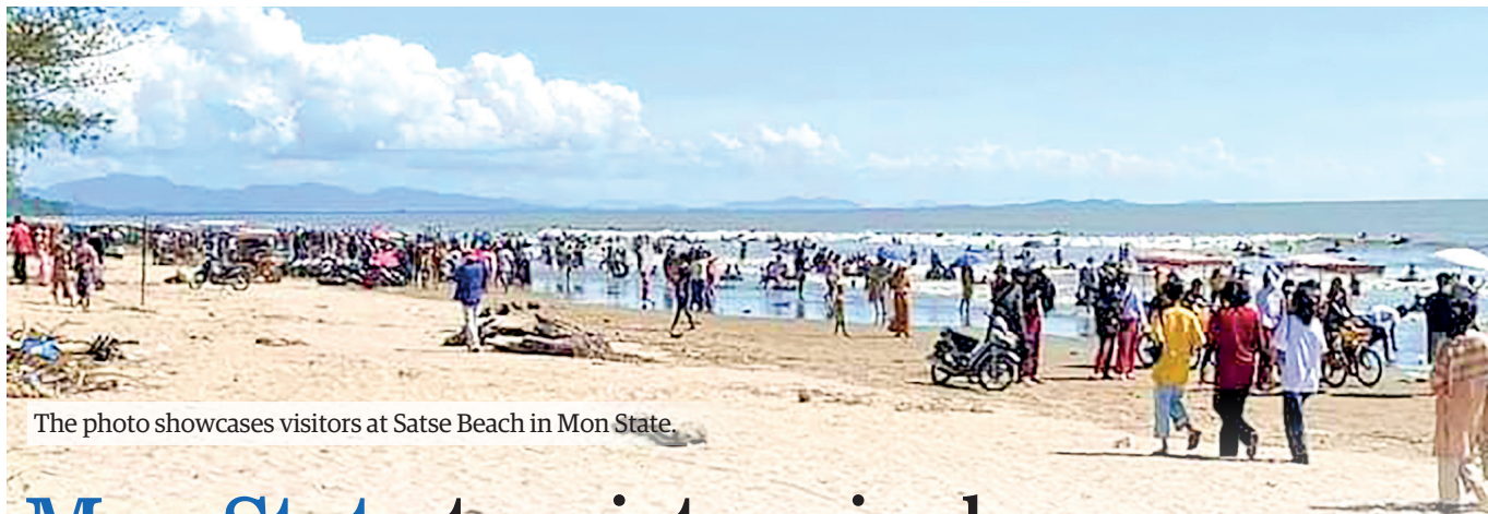
The photo showcases visitors at Satse Beach in Mon State.