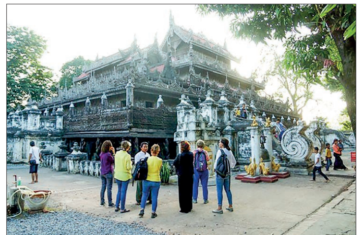
The image depicts the Mandalay Yadanabon Shwenandaw Monastery with thronged visitors.

Successive generations of monks resided in the Shwenandaw Monastery from 1883 to 1995. Since 1995, it has been maintained by the