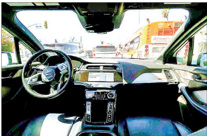
Safety concerns and the cost of developing next-level systems have slowed down progress on autonomous vehicles: PHOTO: AFP

There is a noticeable shift towards prioritizing the resolution of regulatory challenges amid the dynamic evolution of autonomous vehicle technology.