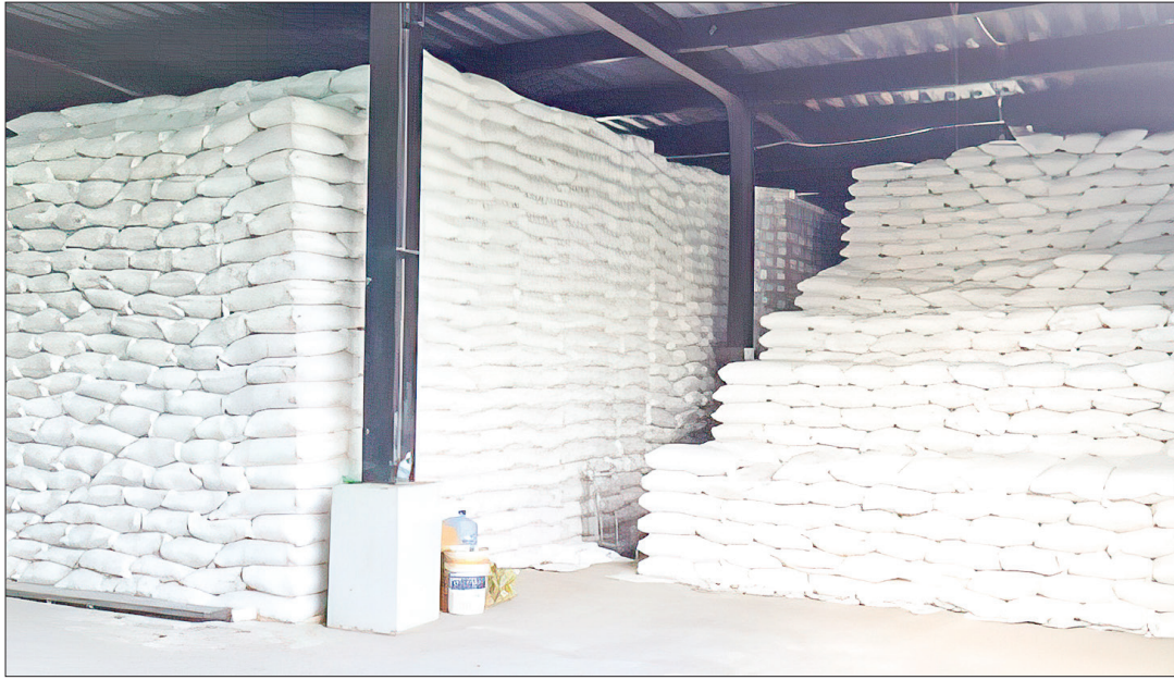
File photo shows the rice bags stored in a warehouse.