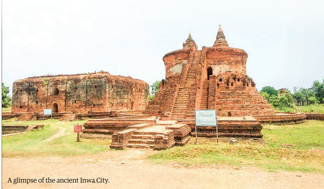
A glimpse of the ancient Inwa City.

"We are researching the numbers of ancient pagodas and buildings within Inwa's buffer zone, along with their histories, in accordance with UNESCO guidelines," the representative