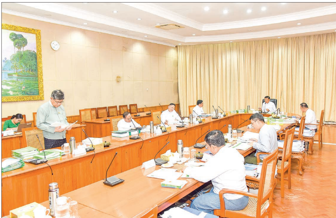
SAC Member Deputy Prime Minister MoTC Union Minister General Mya Tun Oo presides over the 6/2024 meeting of the Myanmar Investment Commission (MIC) yesterday.

THE 6/2024 meeting of the Myanmar Investment Commission (MIC) was held yesterday afternoon in Nay Pyi Taw. State Administration Council Member Deputy Prime Minister and Myanmar Investment Commission Chairperson General Mya Tun Oo and members of the commission attended the meeting.