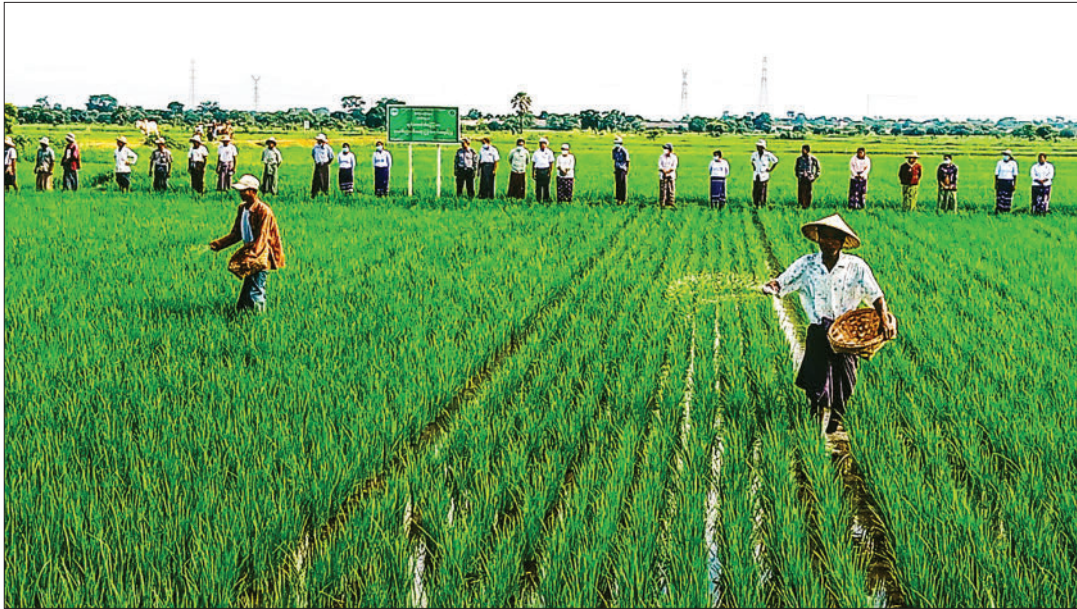
The picture shows a demonstration of broadcasting urea fertilizer in Sagaing Region last year.