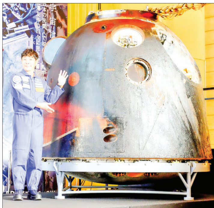
Yusaku Maezawa, the entrepreneur who became the first Japanese civilian to travel to the International Space Station in December 2021, attends an event in Tokyo on 27 November 2023, showing a capsule he used to return to Earth from space.

JAPANESE billionaire entrepreneur Yusaku Maezawa has decided to cancel his planned private space trip to orbit the