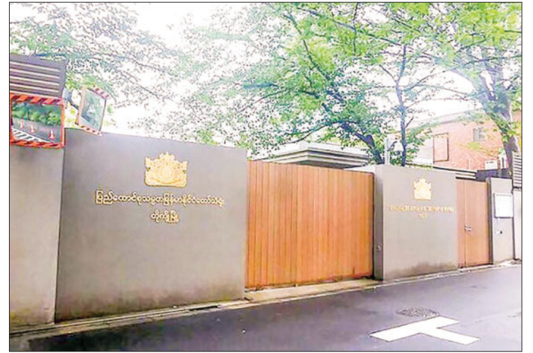
The Myanmar Embassy in Tokyo, Japan.

MORE than 400 Japanese companies will provide jobs for more than 1,300 Myanmar workers, according to a statement issued by the Myanmar Embassy to Japan on 31 May.