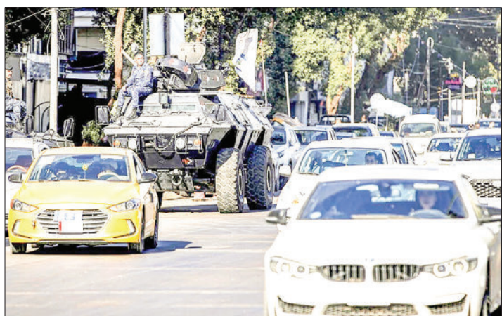
Motorists drive past Iraqi security forces' armoured vehicles in Baghdad on 26 December 2023.

AT the request of Baghdad, the UN Security Council unanimously decided Friday that the United Nations political mission in Iraq will leave the country at the end of 2025 after