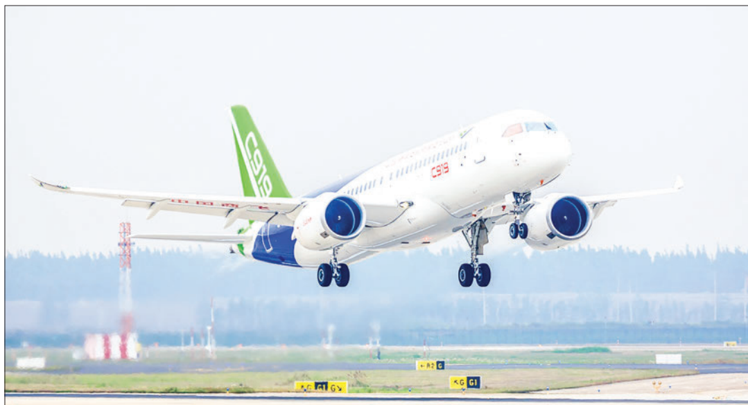
The 6 th C919 jetliner joins the China Eastern Airlines fleet.

China aims to secure a share of the global civil aviation market, which is currently dominated by Boeing and Airbus, with its self-developed trunk jetliner.