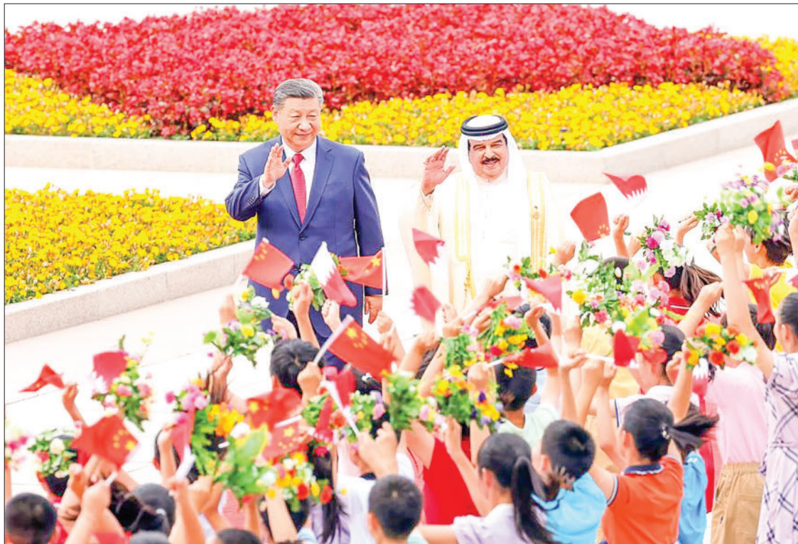
Chinese President Xi Jinping holds a welcome ceremony for Bahrain's King Hamad bin Isa Al Khalifa at the square outside the east gate of the Great Hall of the People before their talks in Beijing, capital of China, 31 May 2024.

The announcement came as Xi held talks with Hamad, who is in China for a state visit. Hamad also attended the opening ceremony of the 10 th ministerial conference of the China-Arab States Cooperation Forum in Beijing on Thursday. Bahrain is a good friend and partner of China in the Gulf region, Xi said, adding that although the two countries have different national conditions, they have always treated each other sincerely and enjoyed friendly relations. As this year marks the 35 th anniversary of the establishment of diplomatic ties between China and Bahrain, Xi said China