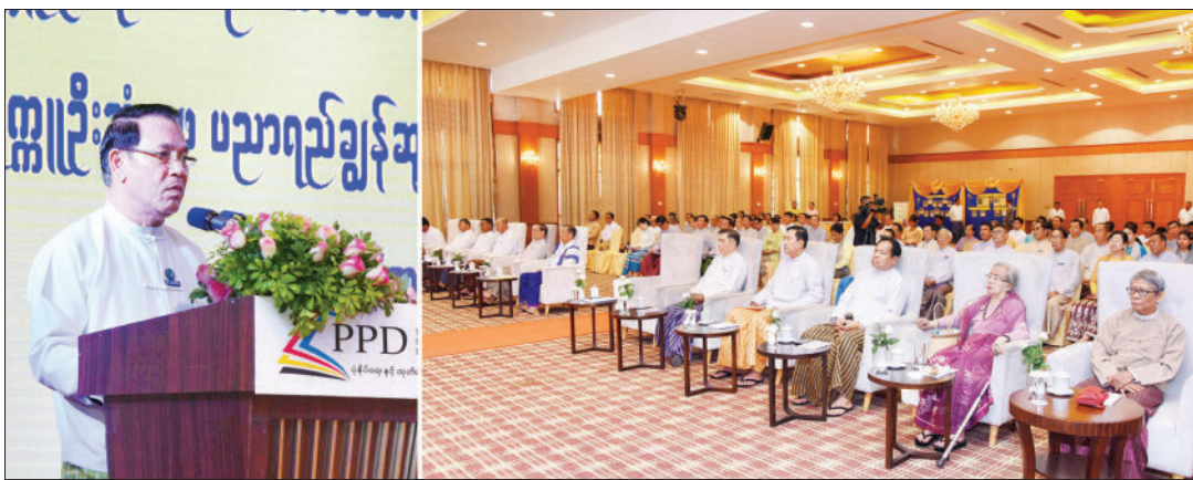
The 29 th Pakokku Literary Award presentation event in 2023.