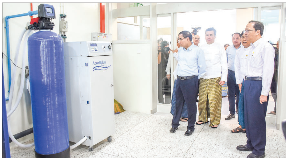
Union Minister for Health Dr Thet Khaing Win inspects hospital equipment at the Aung Thukha four-storey medical building in Bago Region, on 1 June 2024.

Furthermore, the Union minister and officials contributed to the children who underwent the repair surgery for cleft lips and cleft palates.