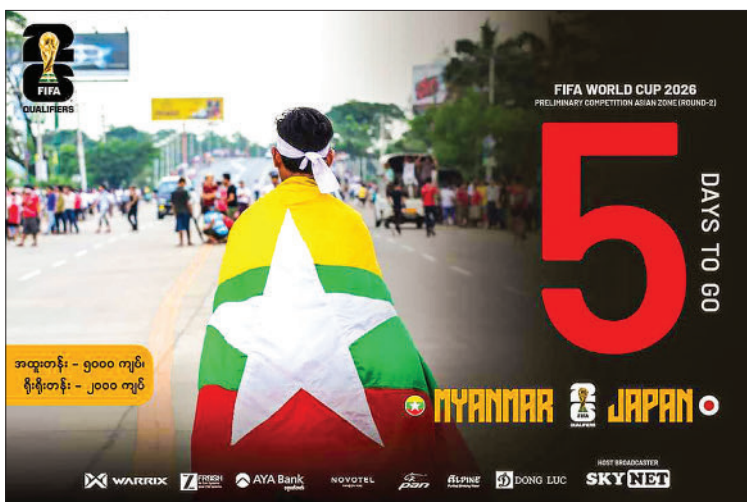
An advertisement poster published online just after the match is five days away.

THE Myanmar versus Japan football match, which will be played soon, has caught the audience's attention.