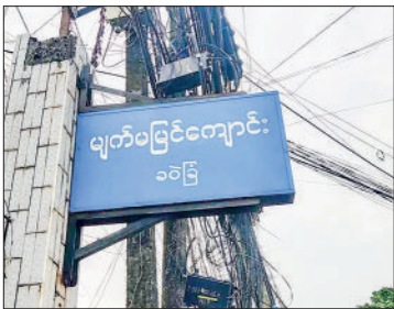
The Kawechan School for the Blind.

MANY people are interested in donating their recorded voices to Kawechan School for the Blind in Yangon's Insein Township, according to a school official. Voice donors come as individuals or groups to read out the books they like or that are available at the school.