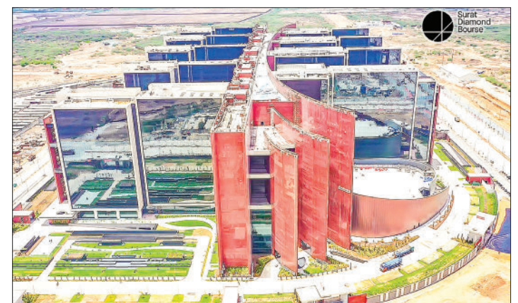
The Surat Diamond Bourse is a state-of-the-art trading centre and marketplace located in Surat, Gujarat, India. The bourse provides a modern and efficient platform for diamond merchants, traders, and buyers from around the world to conduct business. PHOTO: WIKIMEDIA COMMONS

linkages between Indian diamond industry and other global centres. "There are strong connections between Surat and Antwerp, and other centres which are on the global diamond map," the Indian official said. — SPUTNIK