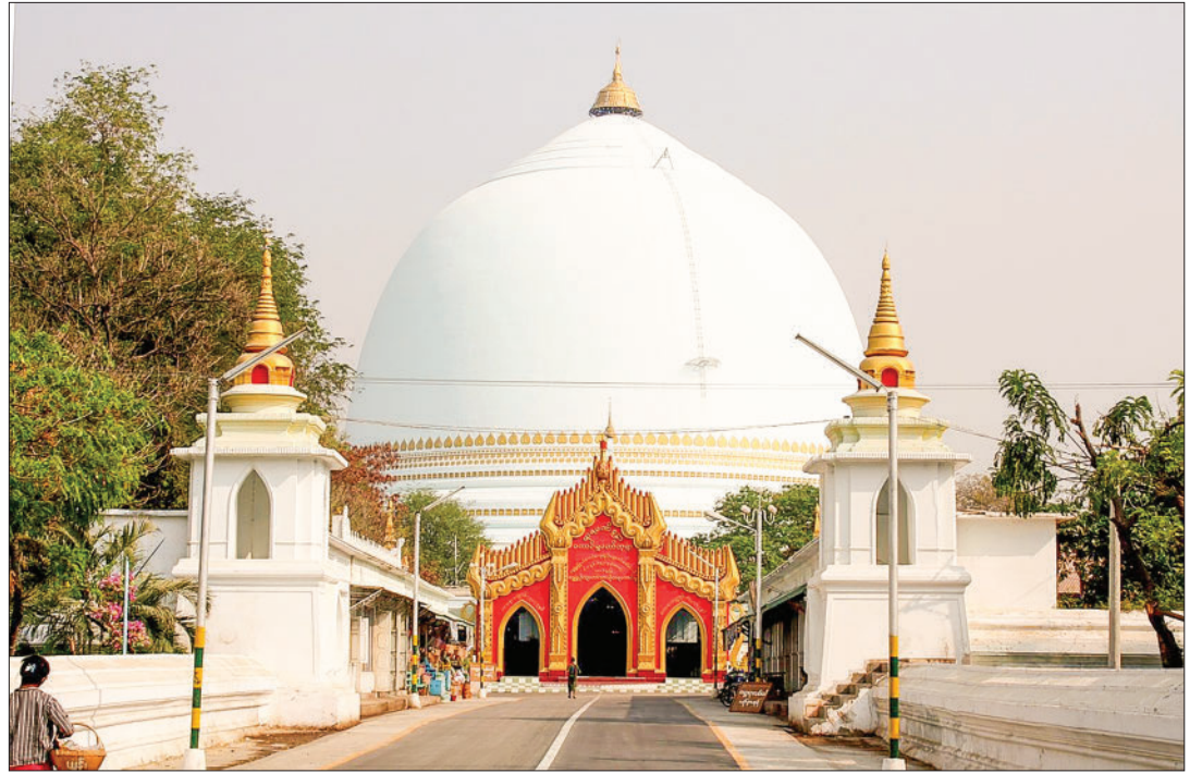
The photo shows one of prominent destination sites in Sagaing Region – the Kaunghmudaw Pagoda.