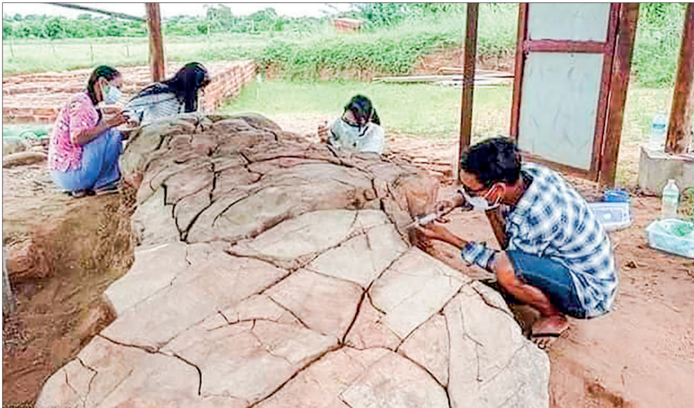
A large sculpture unearthed during the excavation of the Hanlin Palace city wall and Hanlin research team.