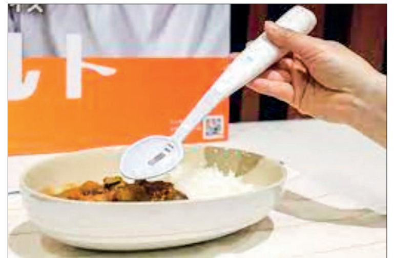
The “Electric Salt Spoon” works by passing a weak electric current through the tip of the device.