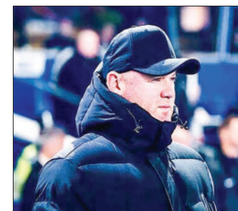
Moyes was furious about the claim and sued Rooney. In the end, Rooney withdrew the accusations he made and also issued a public apology to Moyes.

FORMER England striker Wayne Rooney opened up about the time when manager David Moyes sued him after he made a switch from Everton to Manchester United.