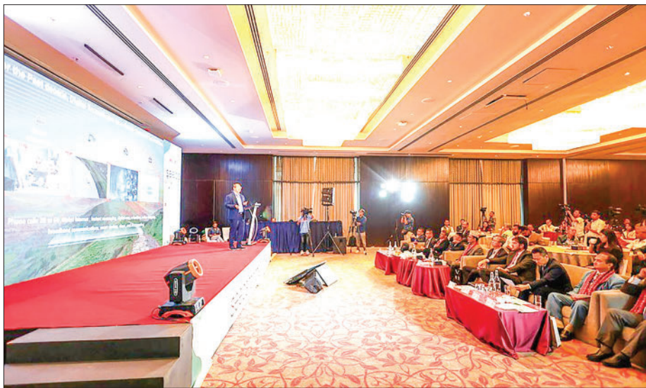
People attend the inauguration ceremony of the Seeds for the Future 2024 programme by the Chinese tech giant Huawei in Kathmandu, Nepal on 31 May 2024.