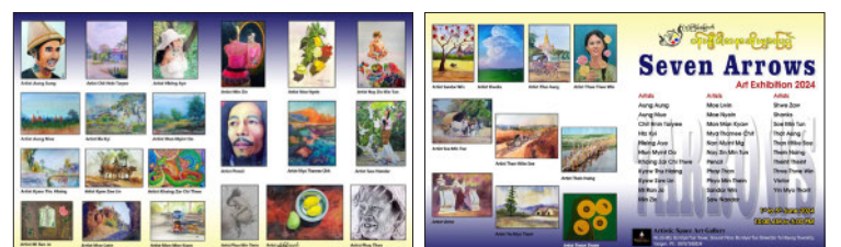
The photo showcases the catalogue for the ‘Seven Arrows’ group art exhibition.

The Seven Arrows group art exhibition will display various beautiful paintings by 32 artists. — ASH/TRKM