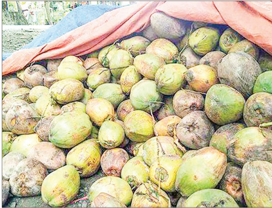
Pieces of coconuts seen in the domestic market.

The delegation led by the chairperson of the Vietnam Coconut Association, experts and attendees also went on a study tour to coconut farms in Yinkadit village, Pantanaw Township, Ayeyawady Region on 30 May. Vietnam’s delegate left for Vietnam