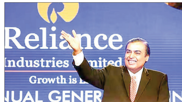
Reliance Industries chairman and managing director Mukesh Ambani.