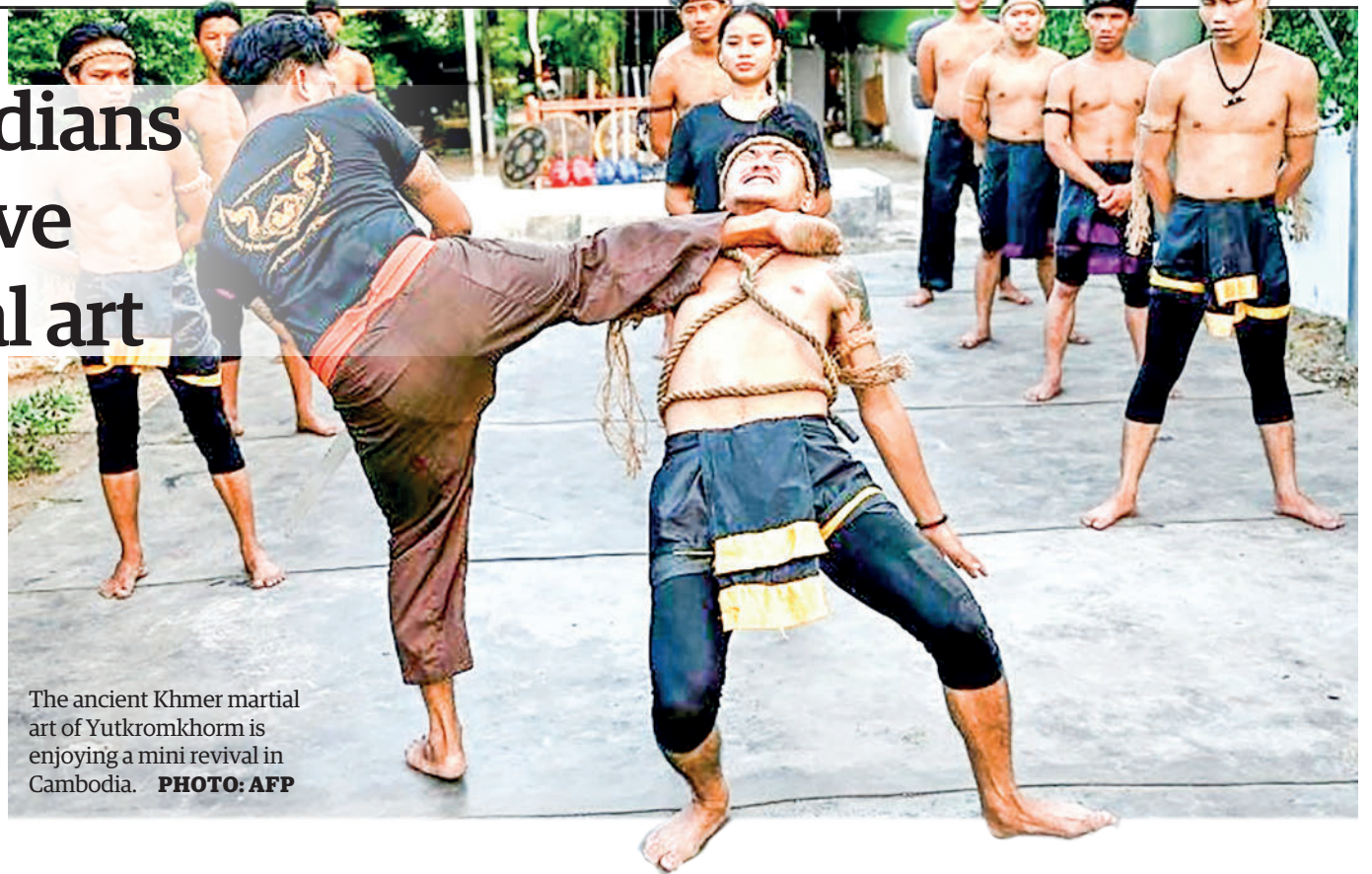
The ancient Khmer martial art of Yutkromkhorm is enjoying a mini revival in Cambodia.

The practice includes kicks, elbow and knee strikes, and includes stick, sword, and spear fighting. Bunthav aims to preserve the martial art for future generations.