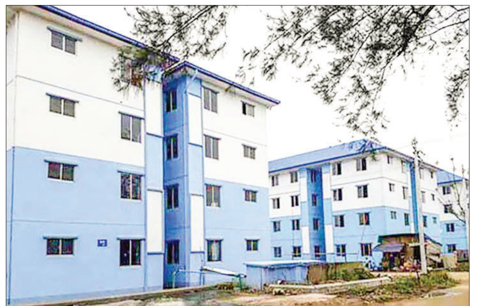
Thilawa low-cost housing flats.

The drawing lots system will be practised in order to follow the CHID Bank’s list. Buyers will be selected on 21 June under the drawing lots system. Those selected buyers must take out a loan, however. Individuals can enquire about the department through contact numbers 067 3407527 and 09795824722. — NN/EM