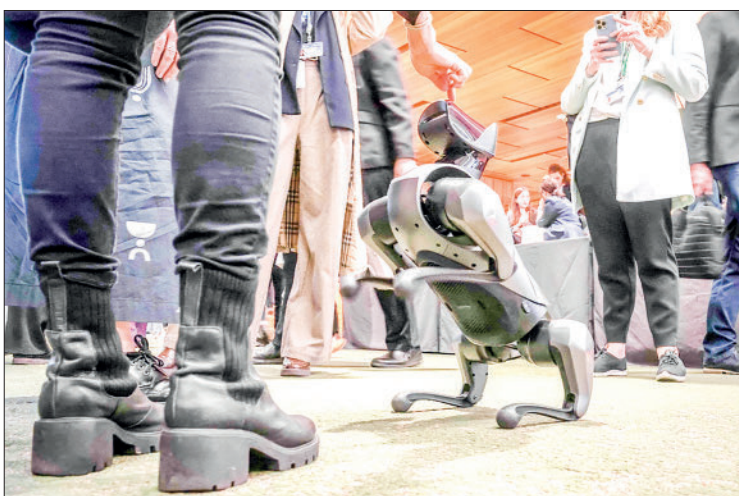
A robot using artificial intelligence is seen at a stand during the International Telecommunication Union (ITU) AI for Good Global Summit in Geneva on 30 May 2024.

The thousands gathered at the conference heard how advances in generative AI are already speeding up efforts to solve some of the world’s most pressing problems, such as climate change, hunger and social care. “I believe we have a once-in-a-generation opportunity to guide AI to benefit all the world’s people,” Bogdan-Martin told AFP ahead of the summit. But she lamented Thursday that one-third of humanity still remains completely offline, and is “excluded from the AI revolution without a voice”. — AFP