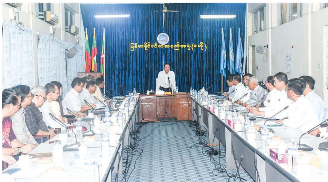
Union Minister for Information U Maung Maung Ohn is seen at the meeting for the reorganizing of the Myanmar Music Association, holding of Myanmar Music Day and Music Academy Award events and copyrights.

He then stressed the need to set the rules and regulations to select the categories of prizes and numbers of prizes for Music