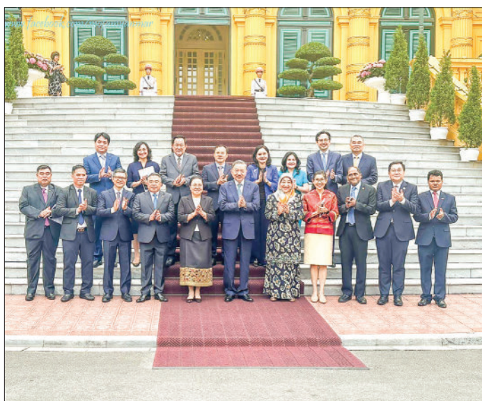
New Vietnamese President Mr To Lam meets heads of missions.

During the meeting, Mr To Lam expressed his gratitude for the congratulatory messages from leaders of the ASEAN member countries and Timor-Leste, while the heads of missions extended their congratulations to Mr To Lam on taking office as the President of Vietnam. — ASH/TMT