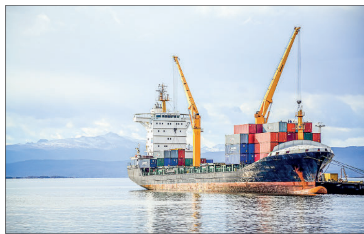
Global shipping’s switch to low-sulphur fuels starting in 2020 “could lead to a doubling (or more) of the warming rate” this decade and has already contributed to record-breaking heat over the past year, the study said.

Scientists had anticipated that switching to the cleaner fuels would reduce this reflecting effect