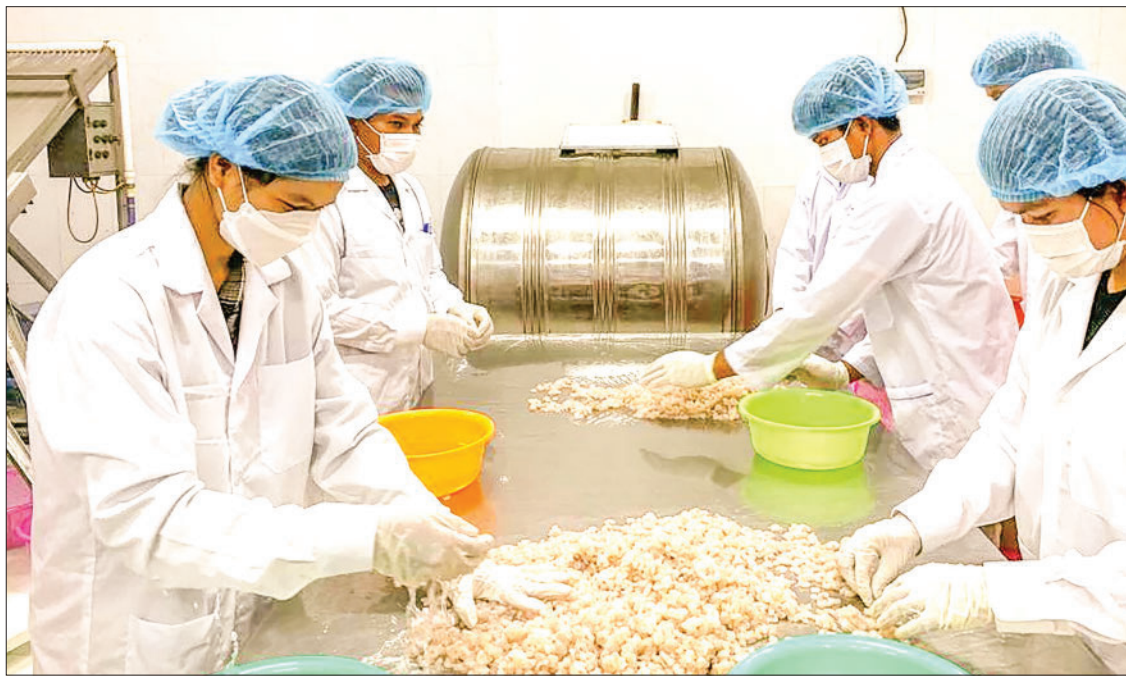
Workers peel shrimps at a factory in Phnom Penh, Cambodia, on 7 September 2023.

Cambodia boasts abundant fisheries resources, offering significant potential for success in the global fish and fishery products market.