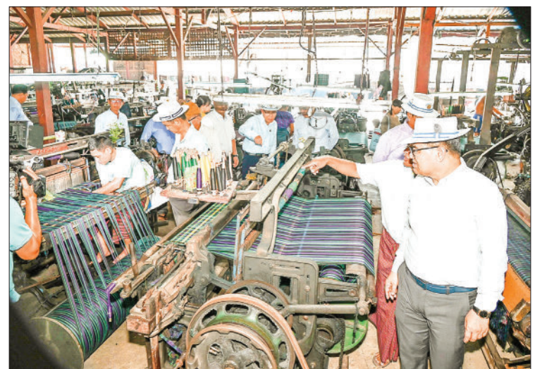
Kachin State Chief Minister U Khet Htein Nan inspects the workplace of Jiangphaw weaving industry in Myitkyina Township on 2 June 2024.

Additionally, the state's chief minister and officials looked into the operation of the state government's paper mill and the distribution of note-