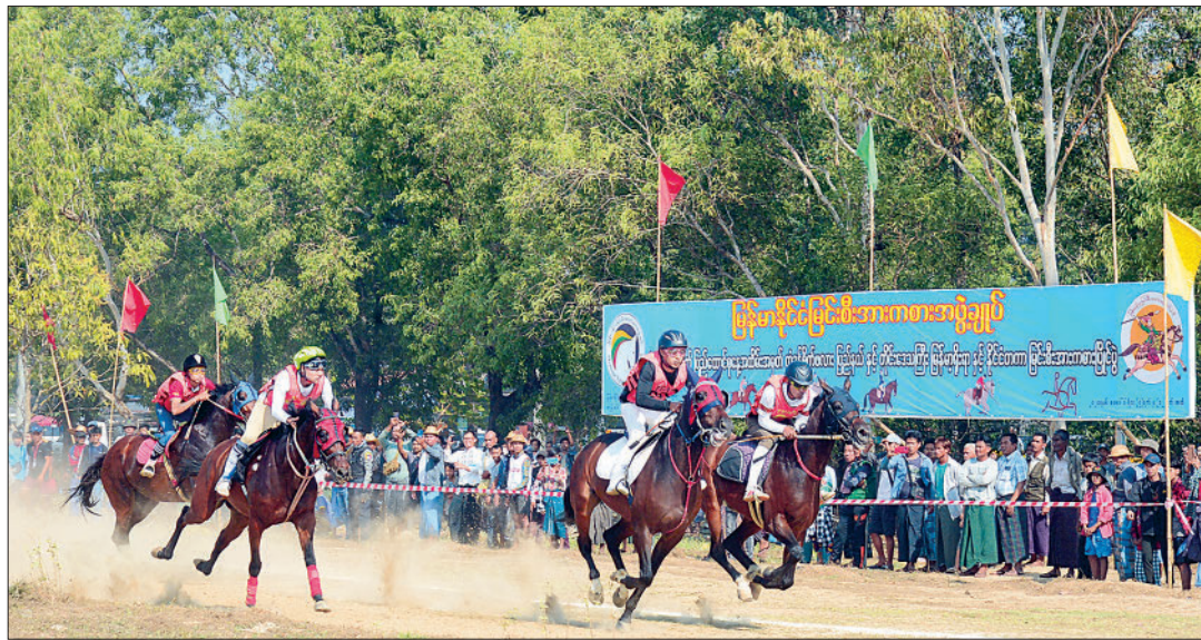
Horse rider seen in action at the competition organized by the Myanmar Equestrian Federation.

On 8 and 9 June, basic and advanced course 1/2024 in horse care will be offered to 20 participants. — TWA/TH