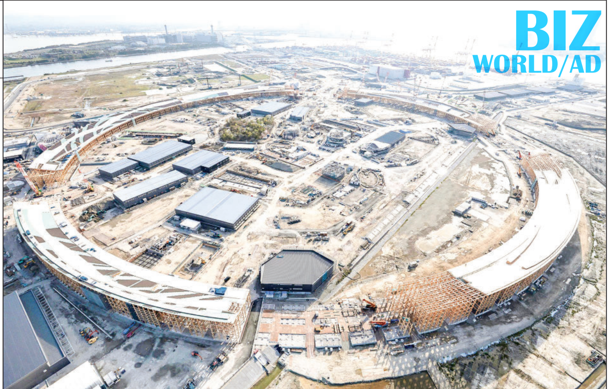
The organizer of the 2025 World Expo in Osaka, Japan, is mobilizing young people to generate public support for the event, which has faced criticism over its high infrastructure costs.

It has pledged to implement greater preferential policies to facilitate the review and approval of medicines for children, and to intensify the protection of related intellectual property rights. — Xinhua