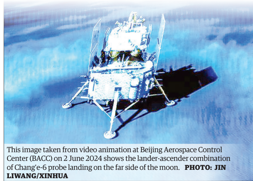
This image taken from video animation at Beijing Aerospace Control Center (BACC) on 2 June 2024 shows the lander-ascender combination of Chang'e-6 probe landing on the far side of the moon.

Huang added that the terrain on the far side of the moon is more rugged than the near side, with fewer continuous flat areas. However, the Apollo Basin is relatively flatter than other areas on the far side, which is conducive