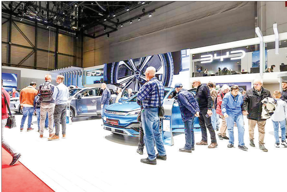
People visit the booth of BYD at the 91 st Geneva International Motor Show in Geneva, Switzerland, 28 February 2024.

"We want fair trade and fair trade means the best product should win with the best price