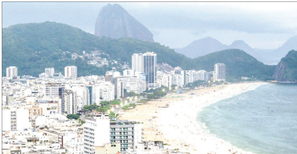
Aerial view of Copacabana beach at Rio de Janeiro, Brazil.