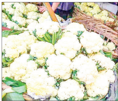
Cauliflowers. PHOTO: MAUNG AYE CHAN

Currently, Thirimarlar green grocery market is open from 4 am to 8 pm. — Maung Aye Chan/KZL