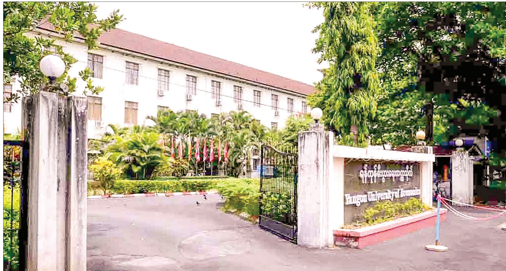
Yangon University of Economics