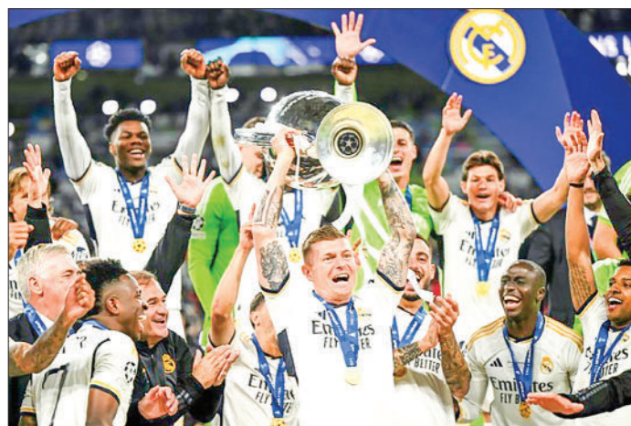
Toni Kroos (centre) won a record-equalling sixth Champions League as a player in the final game of his club career.

Toni Kroos concluded his illustrious club career in style by winning his sixth Champions League title on Saturday.