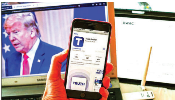
As chairman of Trump Media and the leading figure on Truth Social, Trump wields significant influence over the company's success.