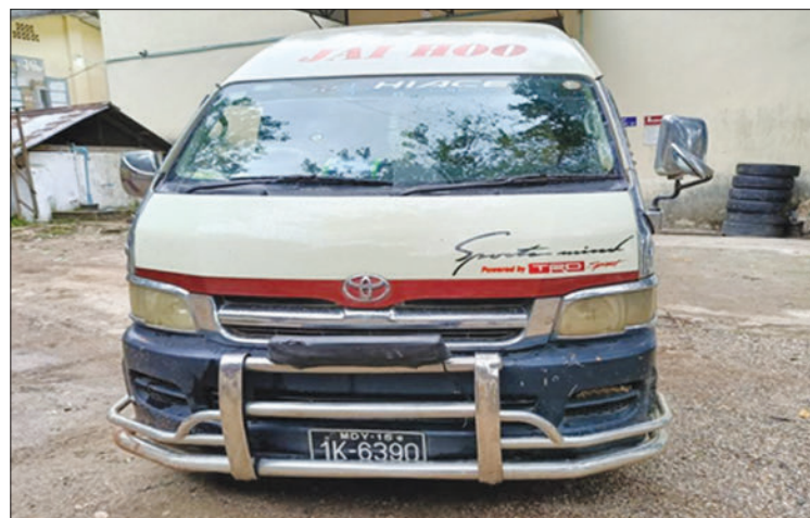
Illegal diesel barrels seized in Mandalay on 31 May.