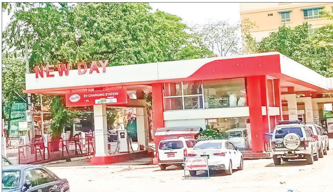
New Day filling station located at the corner of Bargayar Road and Baho Road, where EV charging is provided.

PASSENGERS are keen to ride Electric Vehicle (EV) taxis and many drivers have also been looking for a way to drive an EV taxi.