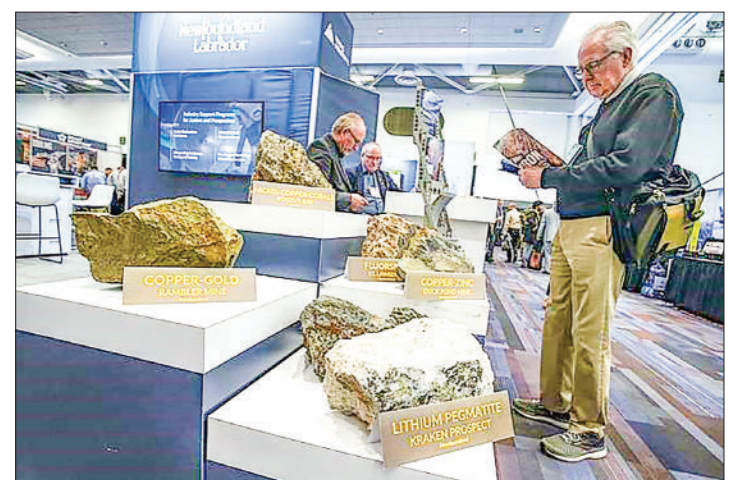
Mineral samples are displayed at a trade show of the Association for Mineral Exploration's Roundup 2024 in Vancouver, British Columbia, Canada, on 22 January 2024.

A 2.4 per cent increase in oil sands extraction, led by higher crude bitumen extraction and synthetic oil production, more than offset the lower extractions of crude oil and natural gas. The oil and gas extraction subsector, as well as the support activities