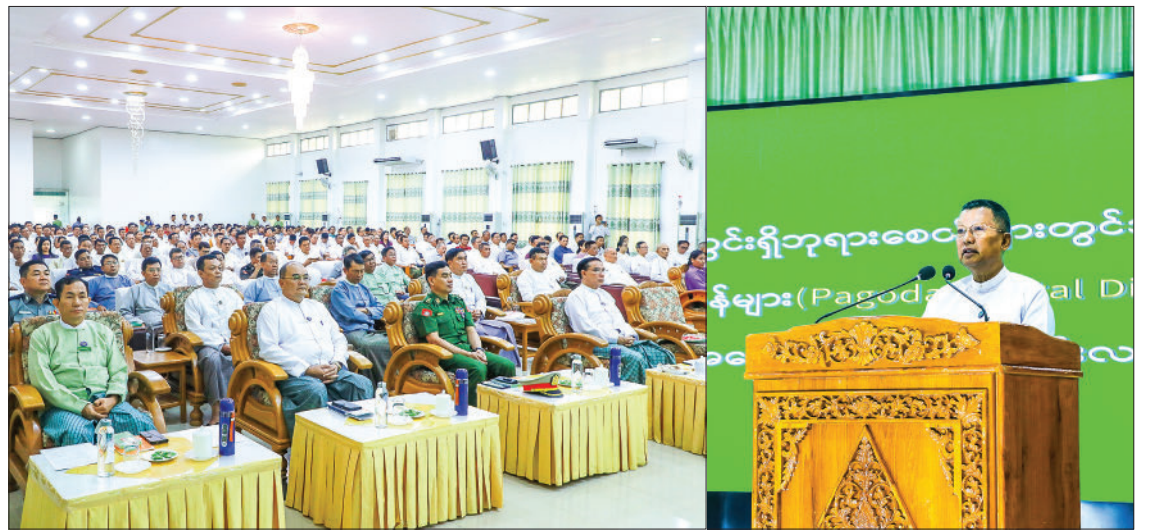
Meeting on preparations for installation of a Pagoda Digital Directory at the pagodas of Bago Region in progress at the City Hall of Bago yesterday.

The briefing was also attended by Bago Region Chief Minister U Myo Swe Win, ministers of the Bago Region Government, the Permanent Secretary of the Ministry of Religious Affairs and Culture, the Director-General of the Religious Affairs Department, the Director-General of the Archaeology and National Museum Department, departmental heads,