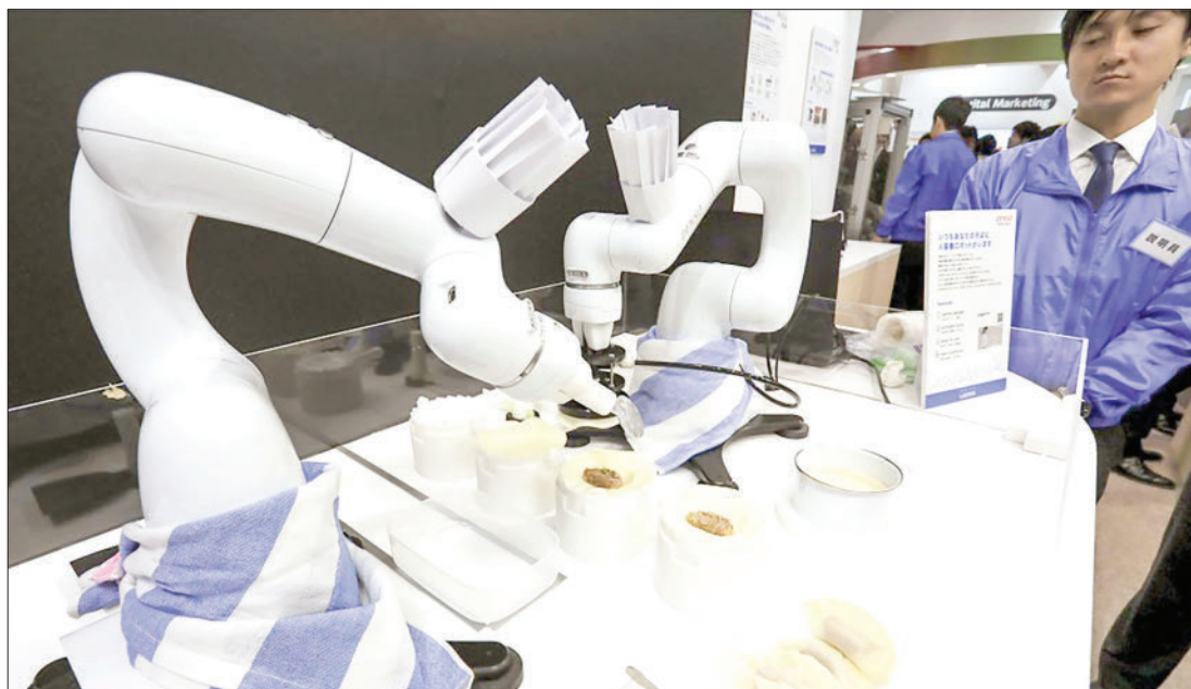
Lawson, a Japanese convenience store chain, has developed a cooking robot to provide convenient meal preparation for busy individuals or those with limited cooking skills. These AI-powered robots can adjust cooking parameters like temperature and ingredient proportions based on real-time feedback, offering quick and easy meal solutions.

The planned statement aims to "promote safe, secure, and trustworthy AI" while pursuing "an inclusive, human-centered, digital transformation," recognizing AI's role in societal development.