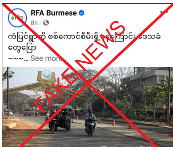
Screenshot on fake news of RFA Burmese.

The truth is the malicious medias are hiding the terror actions of AA terrorists such as attacking towns and villages with heavy weapons, burning the villages of the citizens.