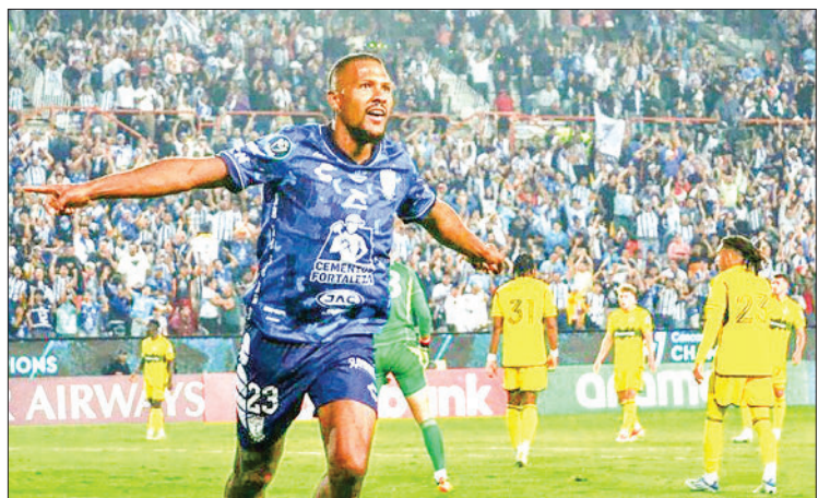
Pachuca's Venezuelan forward Salomon Rondon celebrates after scoring one of his two goals in a CONCACAF Champions Cup final victory over Columbus Crew.

The Myanmar squad has been training since the beginning of this year. In preparation for the AFF U-19 Championship, team Myanmar played tune-up matches in China from 26 May to 1 June while faced two losses: 0-2 in the first match and 1-3 in the second friendly match.