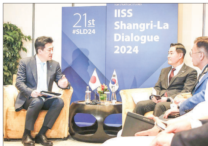
Japanese Defence Minister Minoru Kihara (L) and his South Korean counterpart Shin Won Sik (2nd from R) hold talks on the sidelines of the three-day Asia Security Summit in Singapore on 1 June 2024.

Defence exchanges between the two countries had been largely suspended due to a dispute over Tokyo's accusation that a South Korean destroyer locked its fire-control radar on a Japanese patrol plane in Japan's exclusive economic zone in December 2018.