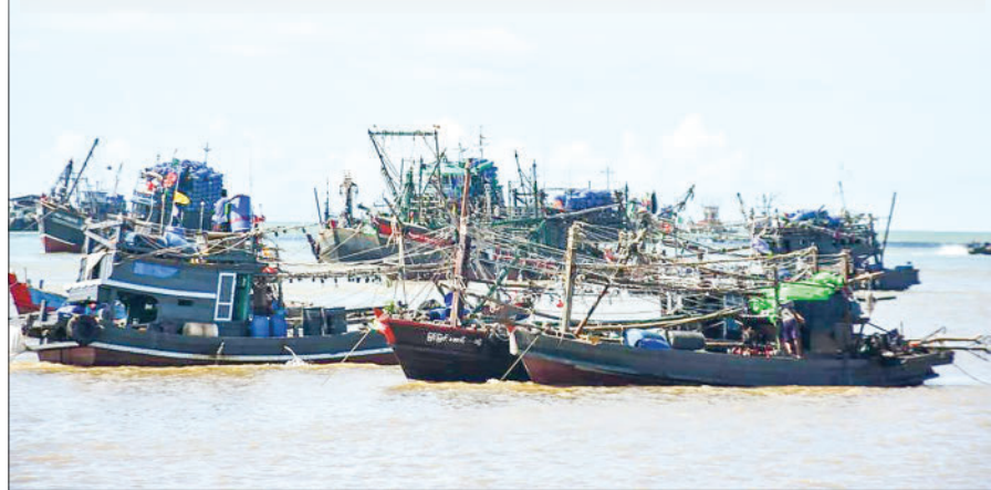
Fishing trawlers are seen in Myeik, on the coast of Taninthayi.