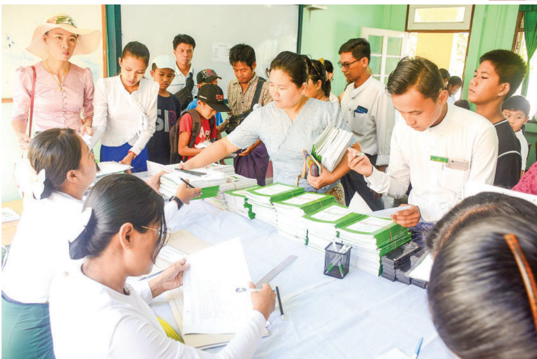
Photos show students and parents are seen at enrolment process for the 2024-2025 Academic Year.

education schools, private schools, and monastic education schools across states and regions. More students are expected to enroll at their respective schools.