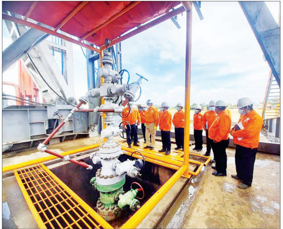
Officials inspect drilling of an oil well in an old oil field.