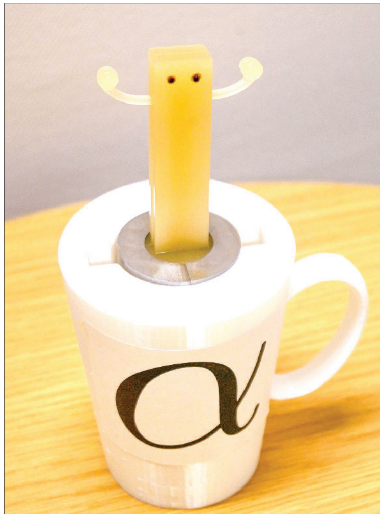
Photo taken on 28 February 2024, in Chofu, western Tokyo, shows the world's first edible robot.

"When Anpanman tears off his face and gives it to someone, it is depicted as tasting even better than usual, and giving people energy," he said, emphasizing that he believes the way people interact with food may cause changes in their sense of taste and texture and produce different psychological and cognitive effects. — Kyodo