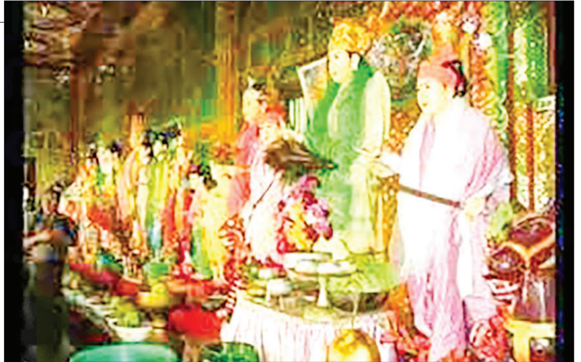
Some Nat statues from Yadana Gu Nat chamber.

“More and more Nat statues have been found missing recently. Nat statues from Yadana Gu have also been lost. Yadana Gu existed since Nyaungyan Period so these Nat statues are also ancient heritages, Nat statue is also a tradition of Myanmar and it is a kind of ritual. It is not worshipping them as the same level as Buddha. People worship them as ritual. And they are ancient cultural assets. Most of Nat statues have been found stolen especially this month. So it is not safe just by locking them. That is why those who take charge of Nat chambers should focus on how they