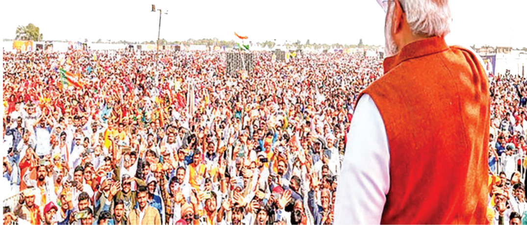
Prime Minister Narendra Modi during his recent visit to Varanasi.

(BJP) and its coalition allies to win 355 seats, well above the 272 needed for a majority in the lower house. Many in Modi's constituency of Varanasi who cast their votes on Saturday were nonetheless excited at the