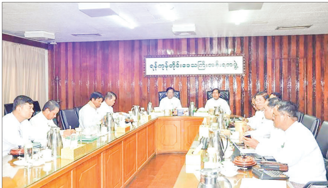
A coordination meeting on development of industry and industrial zones in progress in Yangon yesterday.

The Chief Minister of the Yangon Region Government U Soe Thein provided clarification on the status of industrial activities in the region, land use, and the development of industrial