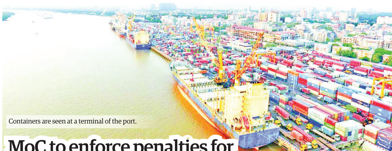
Containers are seen at a terminal of the port.