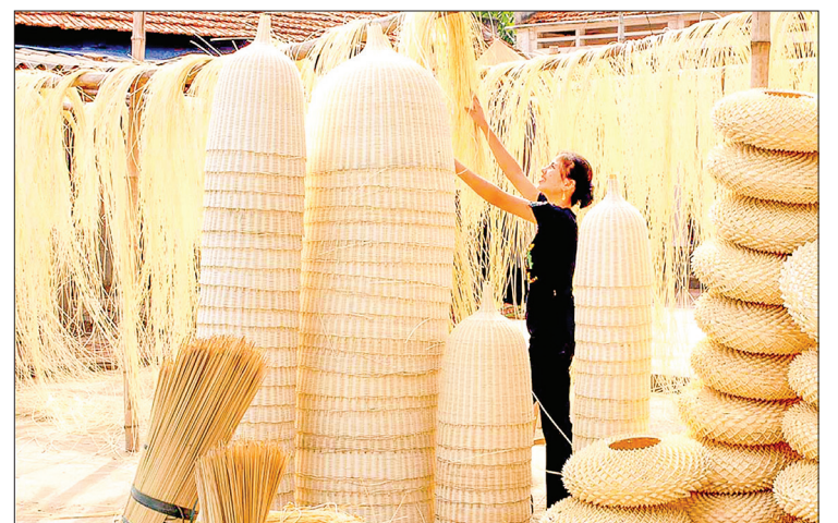
A Vietnamese woman is seen with traditional rattan handicrafts.

The Myanmar Trade Promotion Organization has reported that more than 3,000 businesspeople from the traditional handicraft industry, including those from the US, EU countries, Japan, and Vietnam, are expected to attend the exhibition. — TWA/TRKM