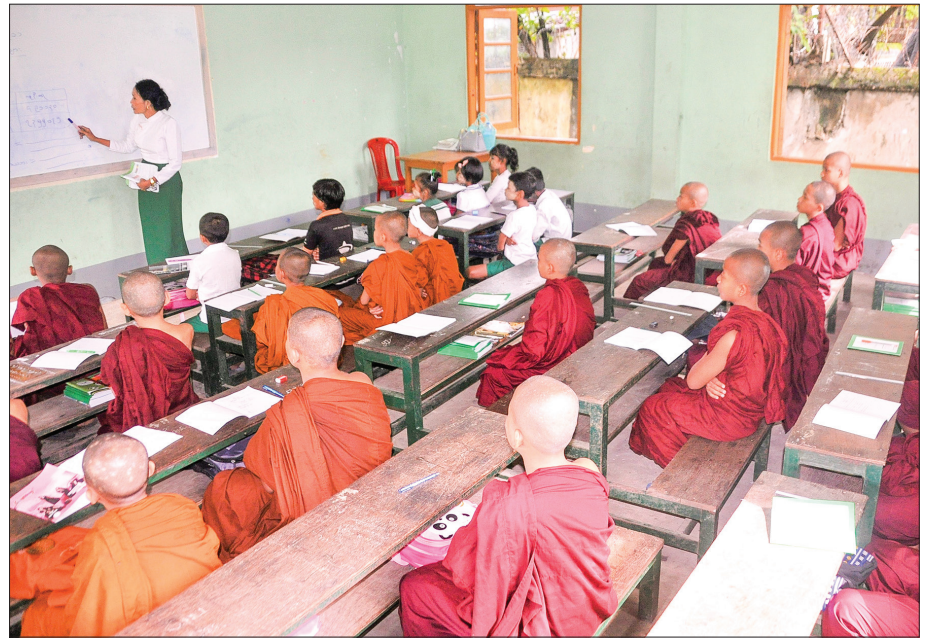
A total of 6,414,799 students, including novices and nuns (pictured), are currently attending schools across the country.

BASIC education schools and monastic education schools across various regions and states, including Nay Pyi Taw, have reopened their doors since 3 June. Students are reportedly attending classes peacefully and happily.