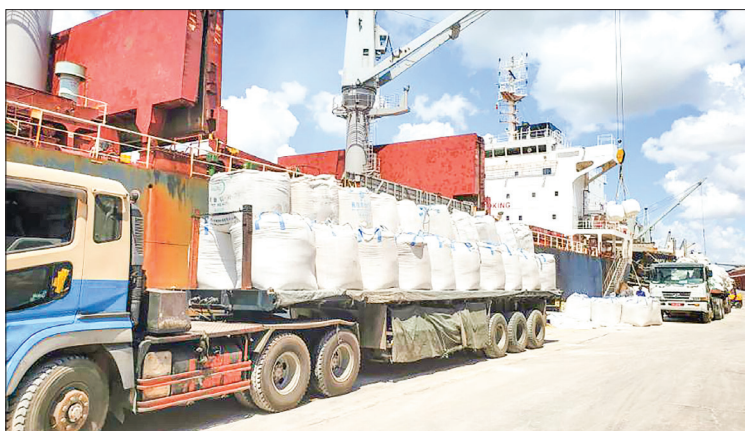
Export cargo seen being loaded onto the vessel.