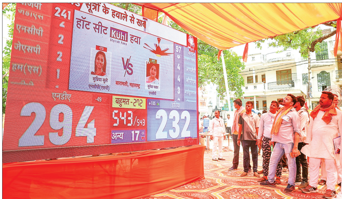
Supporters of the Bharatiya Janata Party (BJP) watch live vote counting figures for India's general election, displayed on a large screen in Varanasi on 4 June 2024

Expressing confidence in the victory, Rai said, "INDIA alliance is going to form the government in the country and