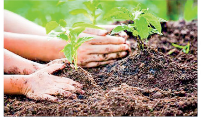
“ သဲကန္တာရတိုက်ဖျက်ရေးနှင့် မိုးခေါင်ရေရှားဒဏ်ခံနိုင်ရေး မြေယာပြန်လည်ဖြူပြင်ပေး ” “ Land restoration, desertification and drought resilience ”