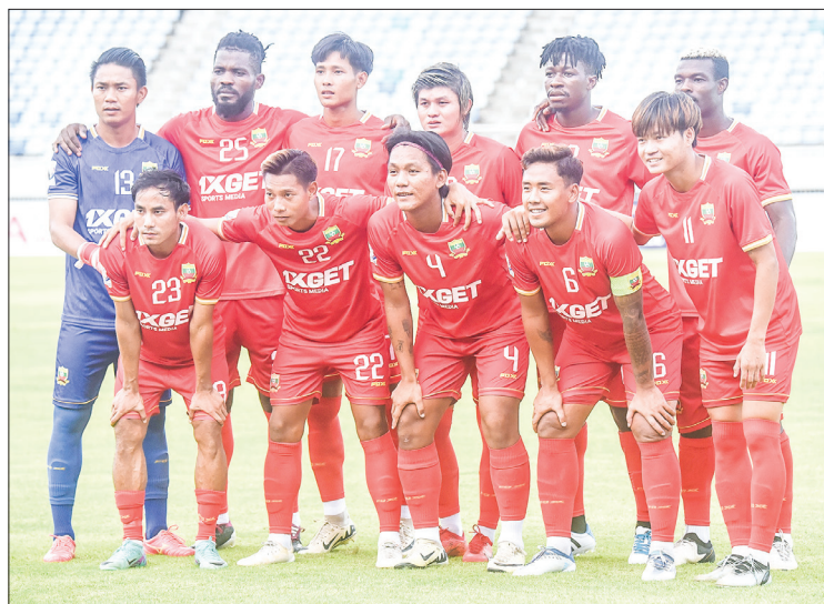
The photo shows Myanmar's Shan United FC, which will compete in the AFC Challenge League tournament.

The Myanmar club will compete in the East Asian zone, and the play-off stage