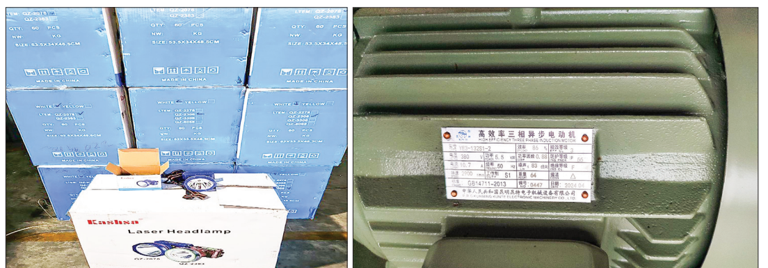
Photos show seized illegal items in Yangon Region.

The Illegal Trade Eradication Steering Committee reported nine arrests and approximately K137 million worth of seized goods across these operations conducted between 2 and 4 June. — MNA/MKKS