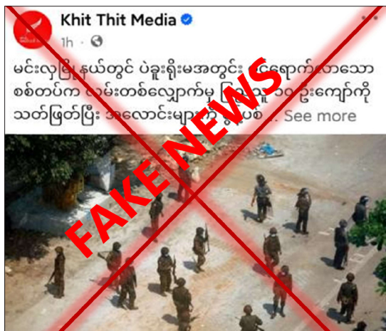
The screenshot validates untruths by malicious media.