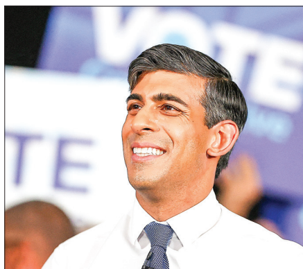
(FILES) Britain's Prime Minister and leader of the Conservative party, Rishi Sunak speaks during a general election campaign event at the ExCeL in east London, on 22 May 2024.

His arrival into the fray diverted attention away from the hour-long debate between Sunak and Starmer, which is