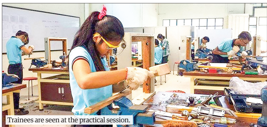
Trainees are seen at the practical session.

THE Department of Social Welfare will open domestic vocational training courses (second batch) in ten big cities, including Yangon, from 10 June to 18 July.