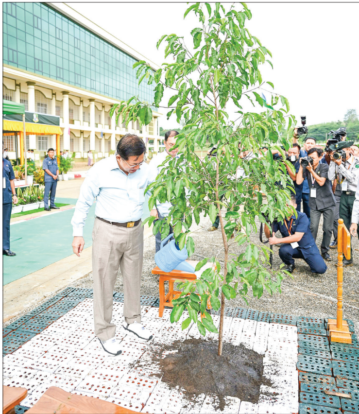
The Senior General plants a star-flower sapling yesterday.

The Senior General continued to say that, according to the UN FAO, the global forest coverage is 10.03 billion acres of land, which is one-third of the total global land. However, such coverage declined by 19.27 million acres per year from 1990 to 2000, 12.85 million acres per year from 2000 to 2010 and 11.61 million acres per year from 2010 to