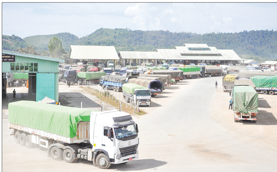
Lorries laden with export cargo ready to cross the Myanmar-China border.

Between 1 December 2021 and 24 May 2024, 3,137 applications by 1,565 fac-