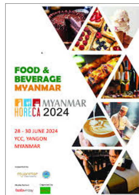
An event poster.

FOOD and Beverage Myanmar/HoReCa Myanmar 2024, which will take place at the Yangon Convention Centre on 28-30 June 2024, will display milk and dairy products, according to the Myanmar Livestock Federation.