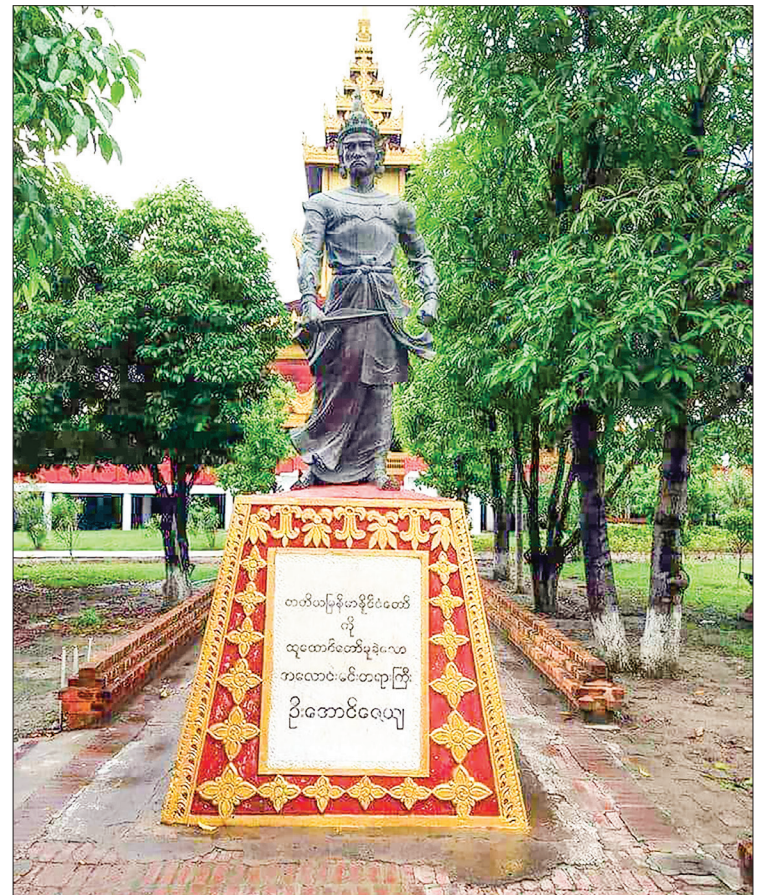
The image depicts a statue of the late King Alaungphaya U Aung Zeya, founder of the Third Myanmar Kingdom.

must attach the necessary documents and apply to the Department of Public Health in the various states and regions where the university matriculation examination centre is located, no later than 16 August.