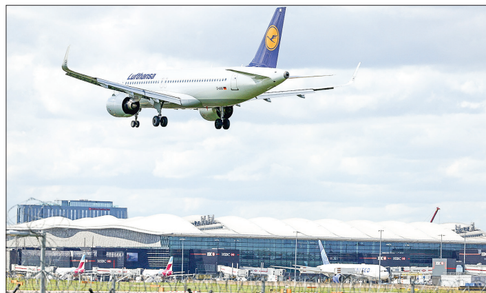
A Lufthansa airlines Airbus-A320-271N comes in to land at Heathrow Airport in west London on 29 April 2024.

tools to improve air travel for everyone,” he added.