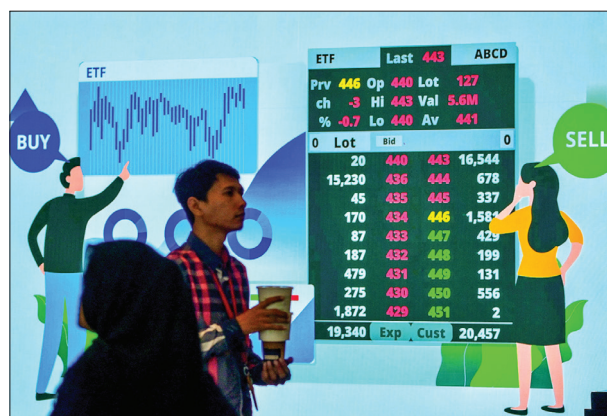
People walk past a large screen displaying advertisements for investing in shares of the Indonesia Stock Exchange in Jakarta on 14 March 2024.

Investors have shifted nervously in recent weeks on concerns that