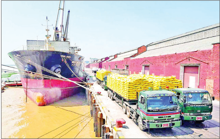
Pulse bags are seen to be loaded onto an overseas-going cargo ship at Yangon Port

MYANMAR shipped over 19,400 tonnes of rubber worth US$26.8 million to foreign trade partners in May through maritime and border trade channels, according to the Ministry of Commerce.