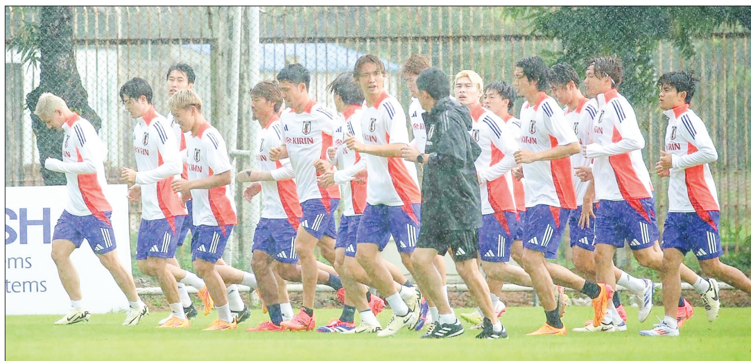
Japan star footballers are seen taking their training in Yangon ahead of the 2026 World Cup qualifiers.

THE Japanese national team arrived in Yangon on the morning of 4 June to play against the Myanmar team as a group match for the second stage of the 2026 World Cup qualifiers.