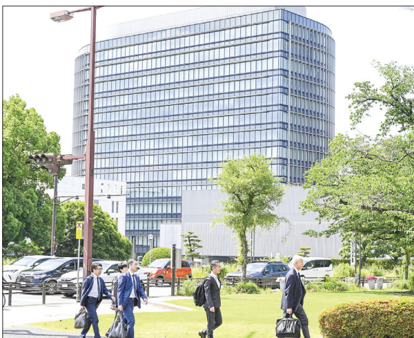
Officials from the transport ministry head to Toyota Motor Corp's headquarters in Toyota, Aichi Prefecture, to conduct an inspection on 4 June 2024.

Government inspectors are expected to examine whether the Ministry of Land, Infrastructure, Transport and Tourism should instruct the carmaker to issue recalls through the probe.