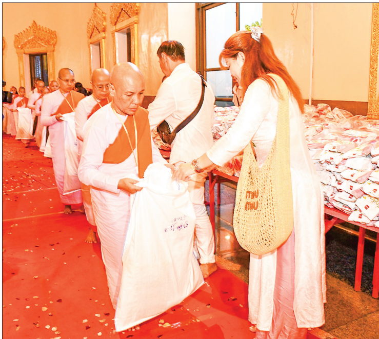
The presentation of donations to nuns in progress on 3 June.