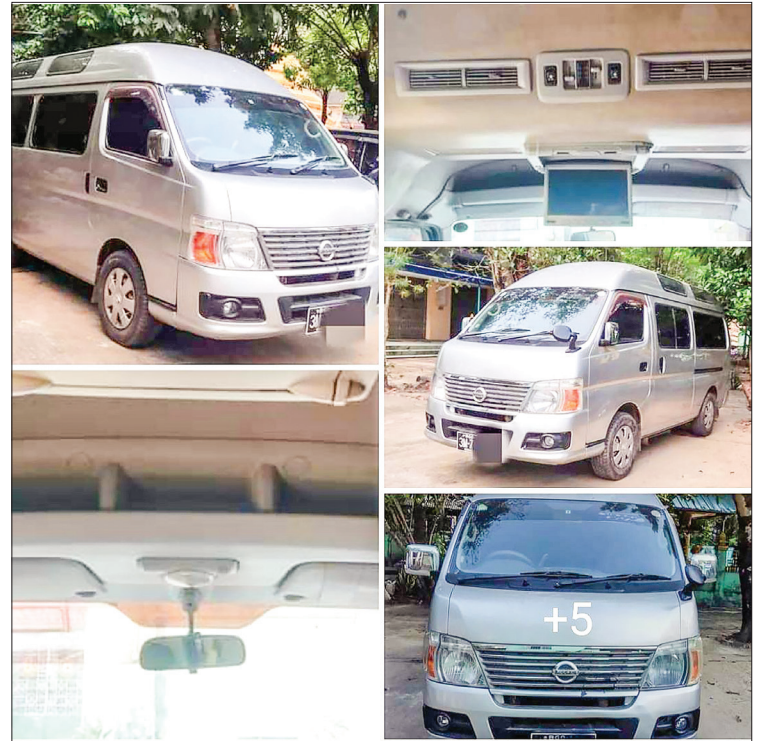
Some cars are displayed for sales in the auto market on Facebook.

If there is no significant policy change, according to the car market nature, the sales resume from May and June till