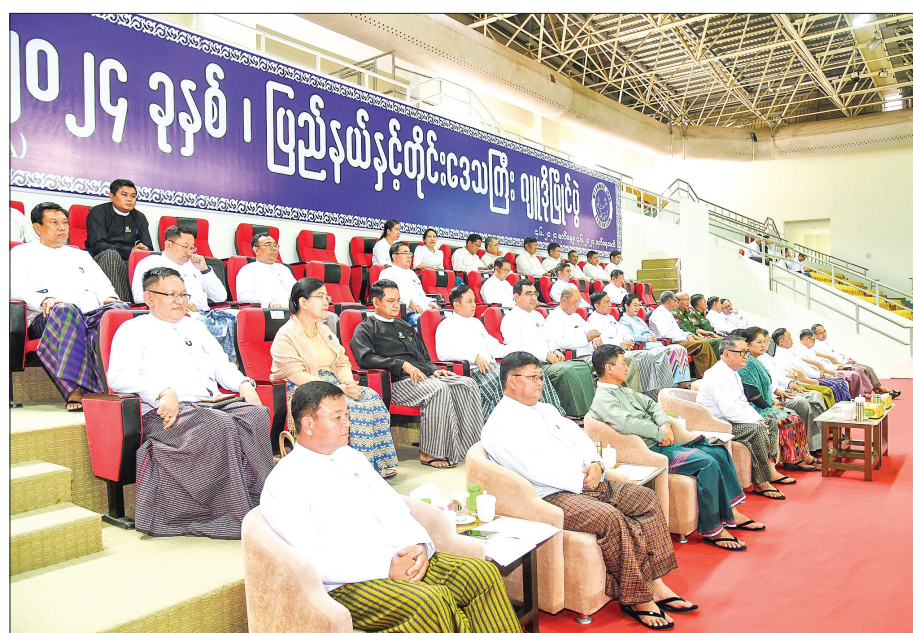
SAC members, the Union ministers and dignitaries watch the matches at yesterday's opening event in Nay Pyi Taw.