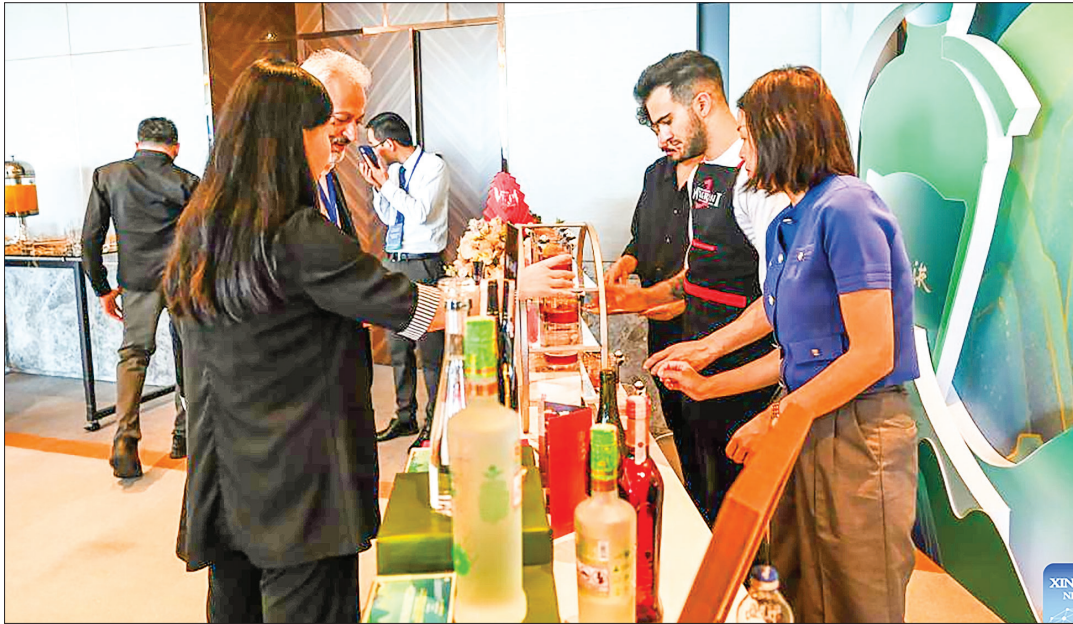
People communicate during the China (Sichuan) - Türkiye Economic and Trade Exchange Conference in Istanbul, Türkiye, on 3 June 2024.