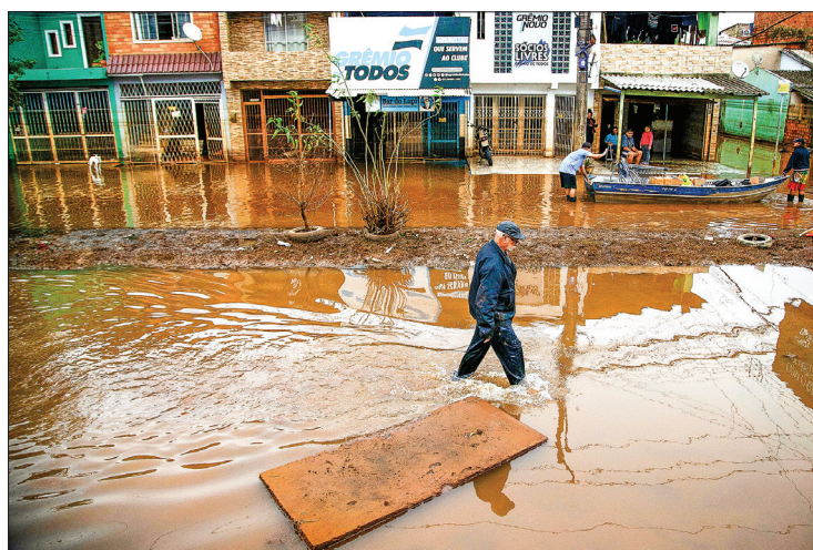
People walk on a flooded street around the Arena do Gremio stadium in Porto Alegre, Rio Grande do Sul state, Brazil, on 29 May 2024.

"The researchers estimated that climate change made the event more than twice as