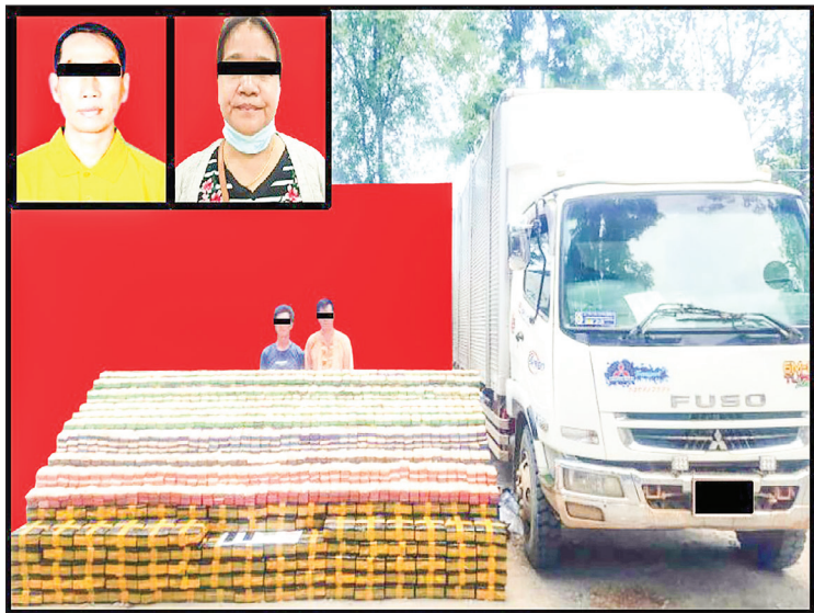
Offenders are seen alongside confiscated drugs and a vehicle.

MYANMAR Police Force announced the seizure of 55 kilograms of heroin in Kalay Township, Sagaing Region. The seized drugs have an estimated street value of K2.75 billion.