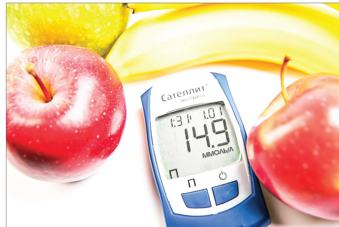
Regular counselling about monitoring, dietary habits, and daily routines can lead to better management of diabetes.

Regular counselling about monitoring, dietary habits, and daily routines can lead to better management of diabetes. How-