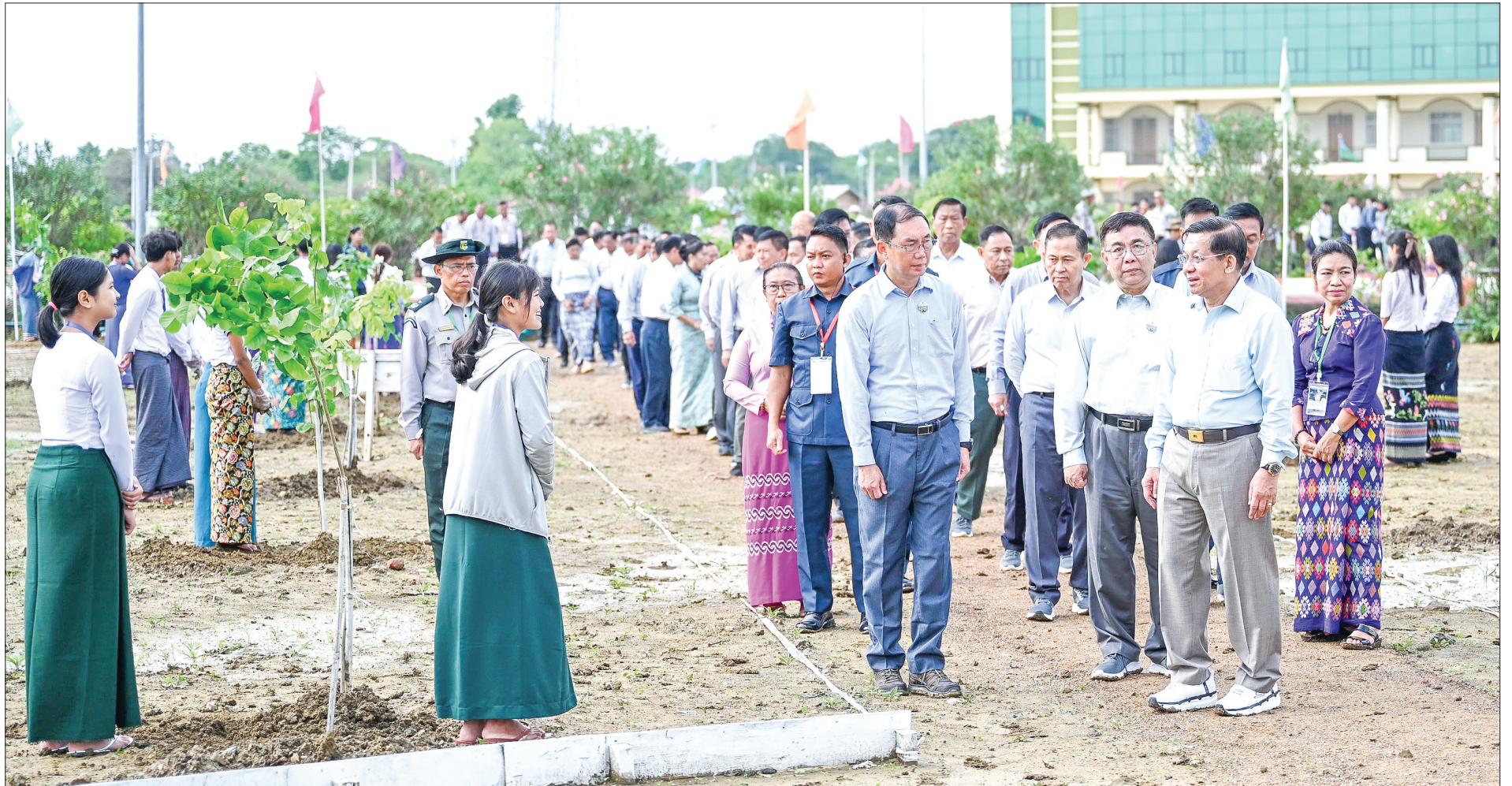
State Administration Council Chairman Prime Minister Senior General Min Aung Hlaing views round the activities in the 2024 monsoon tree-planting event yesterday in Nay Pyi Taw.