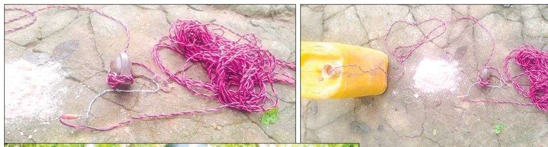
A homemade bomb, a plastic box and accessories are seen after deactivation.