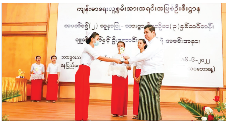
The photo shows the graduation event of the three-year courses for nursing for midwifery diploma course No 2 in 2022. PHOTO:

These courses will be opened at the Department of Human Resources for Health and Nursing and midwifery training schools for the 2025 academic year, and those who want to attend the course must meet the requirements and must take the entrance exam covering Myanmar, English and Math.