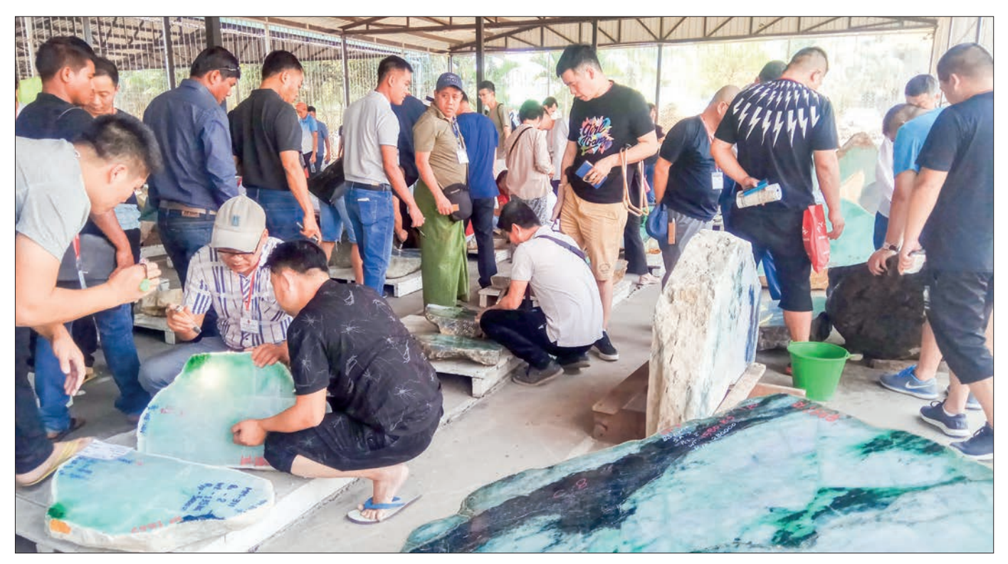
Gem merchants are seen evaluating jade at the previous Gems Emporium.

A total of 268 gem trading licences are due to expire in July 2024, Myanma Gems Enterprise notified.