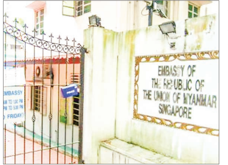
Myanmar Embassy in Singapore.

Those who want to do passport extension on 23 June can register along with passport page and front and back copy of unexpired Identity Card (IC) which are required to submit to WhatsApp number +6581748993, from 1 June to 14 June and the list of eligible names will be an-