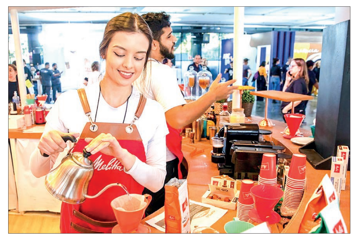
A staff member prepares coffee during the Sao Paulo Coffee Festival in Sao Paulo, Brazil, on 23 June 2023.

Brazil's GDP in the first quarter of 2024 grew by 2.5 per cent compared to the same period in the previous year, according to the Brazilian Institute of Statistics (IBGE).