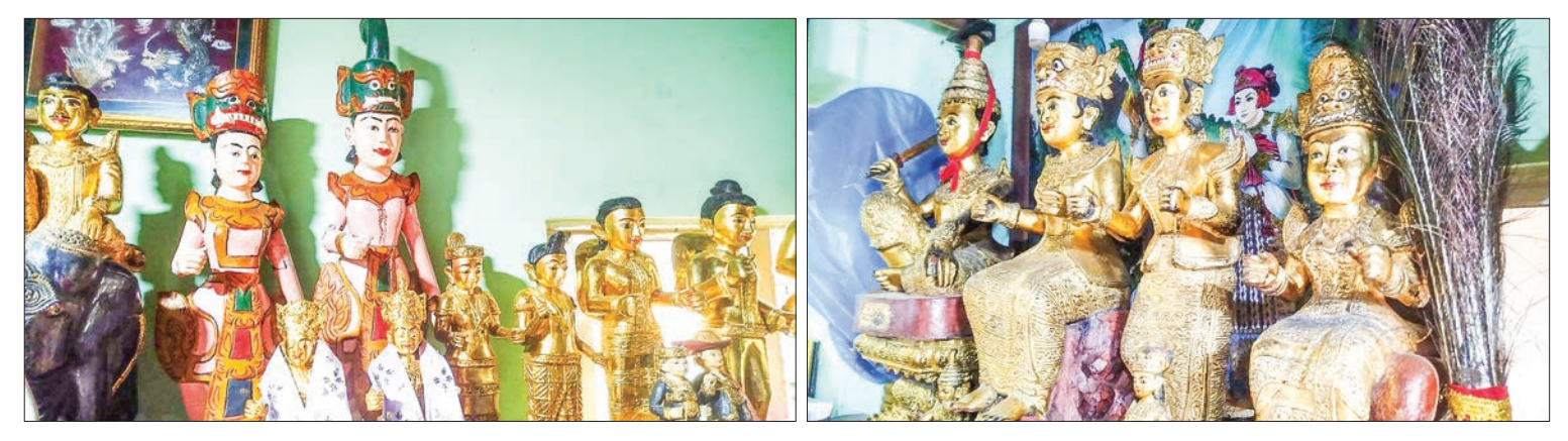
Spirit images used in Nat Festivals.

FOR the first time in Myanmar, a ceremony to pay obeisance to elderly Deva experts will be held in Yangon, and plans are underway to continue this tradition in the coming years, according to the organizers of this ceremony.