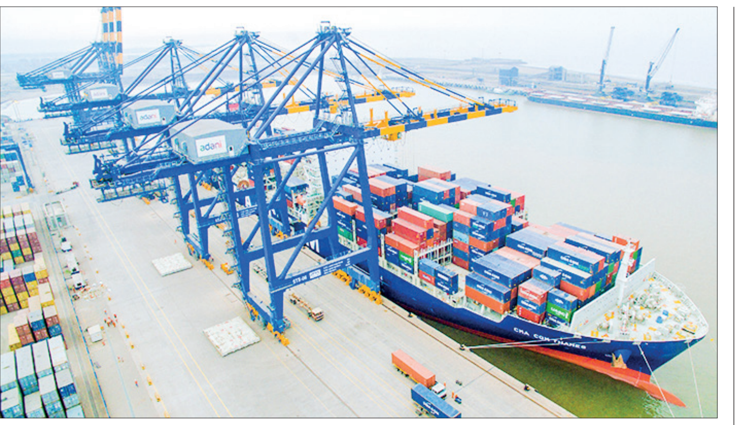
A bird's-eye view of the Yangon International Gateway Terminal on the Yangon River.