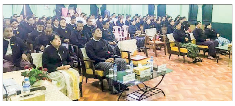
The opening ceremony of the capacity-building training programme 1/2024 for Yangon Region High Court staff.

This course aims to implement the lessons learned effectively, enhancing the efficiency of staff members at the Yangon Region High Court and various court departments. It also seeks to improve office management skills and ensure adherence to staff rules and ethical standards. — TWA/TMT