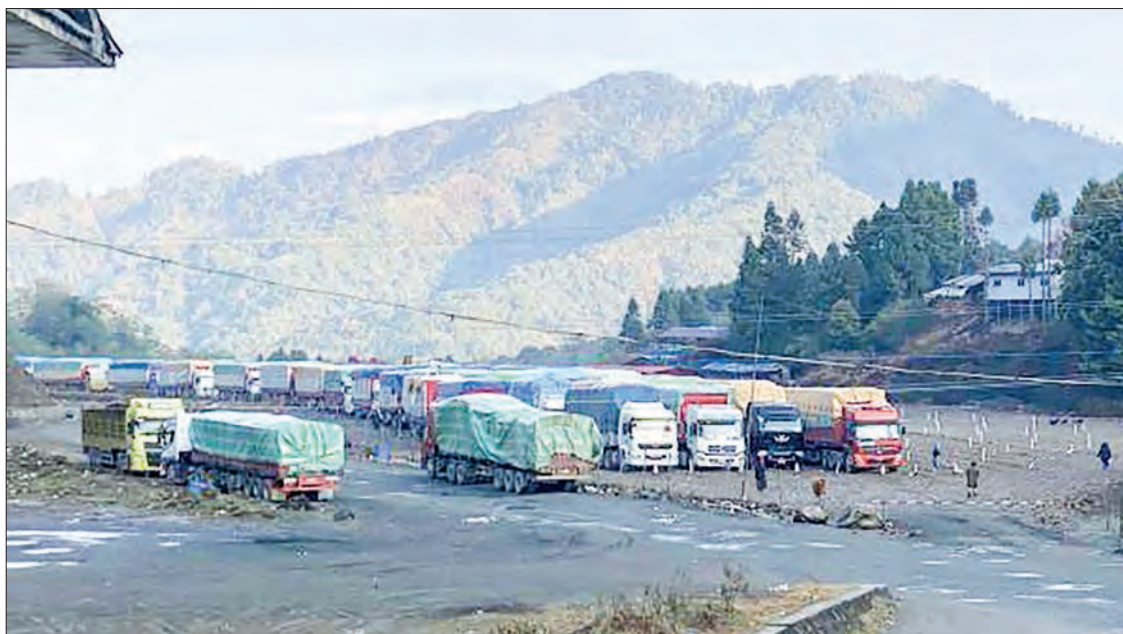
This photo shows trucks entering the Kampaiti border crossing in 2023.

The main export items at the Kampaiti border were tis-