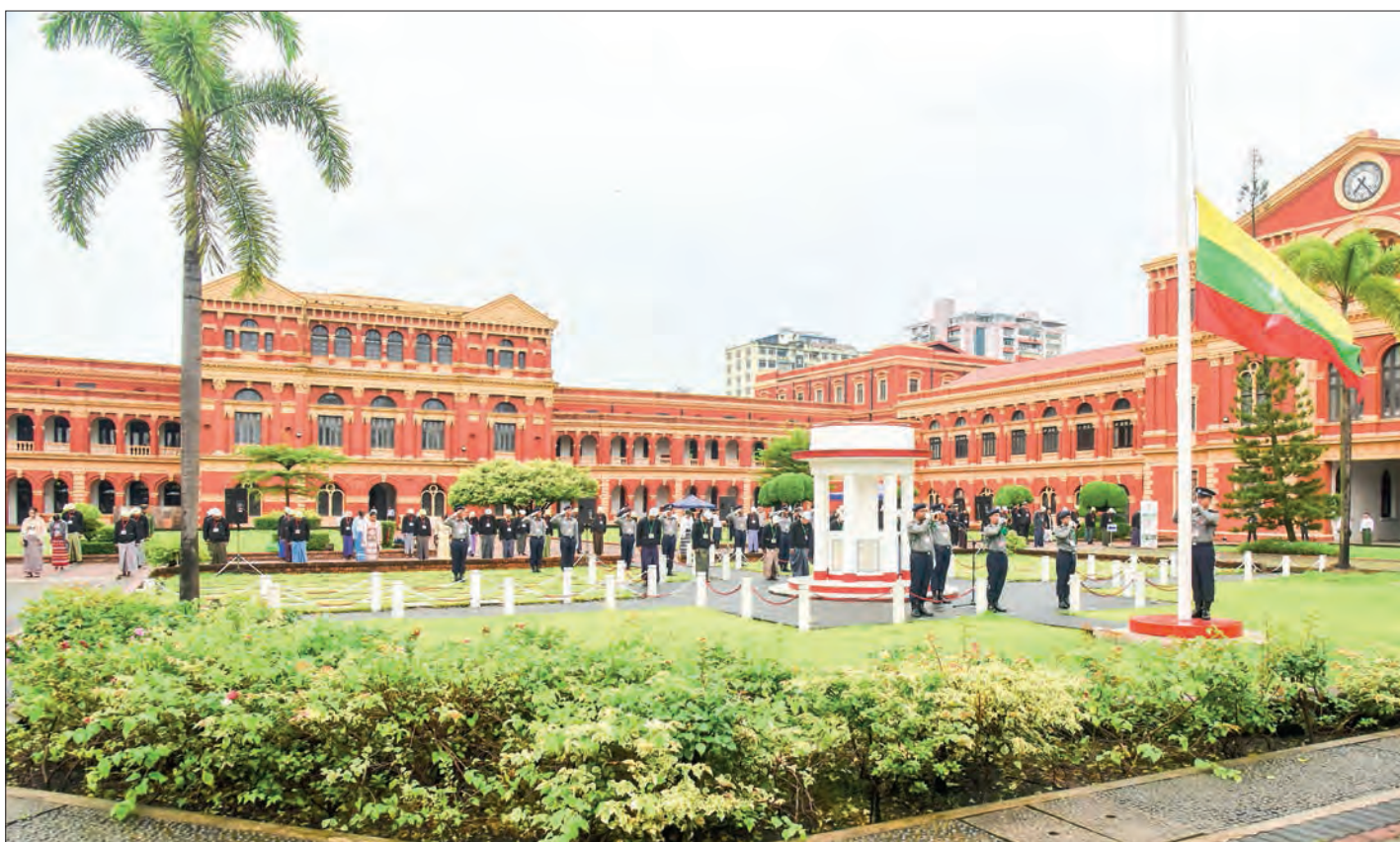
The ceremony of lowering the State Flag to half-mast in progress at the Secretariat (Former Ministers' Office) in Yangon yesterday. PHOTO: KANU

Visitors, including students, thronged to the meeting hall where martyrs were assassinated, 28 types of exhibits that remained of martyred leaders and other historical records in the parliament building, which is more than a hundred years old yesterday. — MNA/KZL