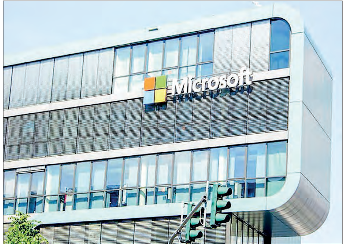
Microsoft said access was limited as some users were only able to access Microsoft 365 in read-only mode while it works to fix the problem.

treating this event with the highest priority and urgency while