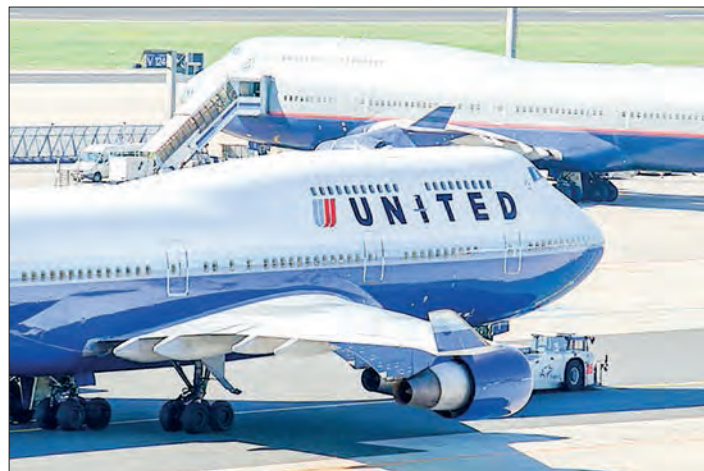
Profits at the major US carrier came in at $1.3 billion in the second quarter.

United's shares declined 1.3 per cent in after-hours trading. — AFP