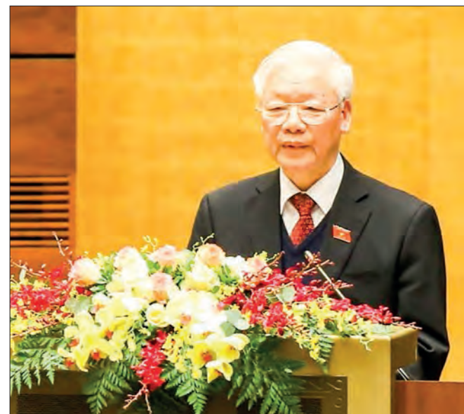
This file photo taken on 24 March 2021 shows General Secretary of the Communist Party of Vietnam Central Committee (CPVCC) and then Vietnamese President Nguyen Phu Trong delivering a report at the opening session of the 11 th session of the 14 th National Assembly (NA) of Vietnam in Hanoi, Vietnam. Nguyen Phu Trong passed away at the age of 80, Vietnam News Agency reported on Friday.

Trong was president from 2018-21 and served three consecutive terms as general secretary, the first to do so since the “doi moi” era of economic reform began in 1986. — AFP