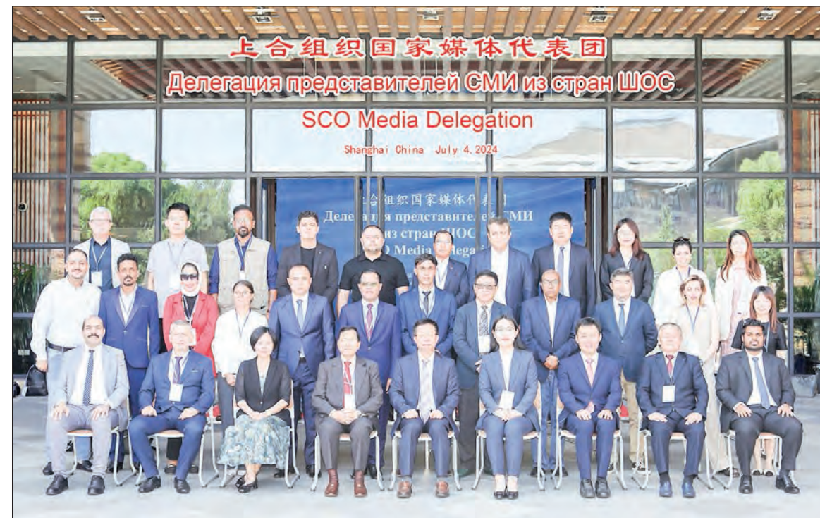
A group photo of SCO media delegations with host officials at the International Exchange and Judicial Cooperation (CNISCO).

At the invitation of the GNFCC, I, as a media representative from Myanmar, joined other SCO country media representatives to observe firsthand the effective operations of the SCO. That encompassed attending events and visiting compelling locations organized by the host.