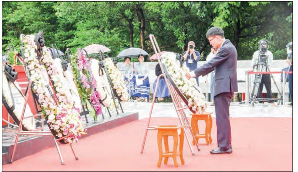
Heads of missions of foreign embassies to Myanmar and charges d'affaires ai lay wreaths at Martyrs' Mausoleum yesterday.