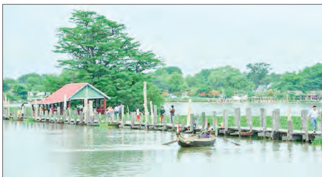
This photo shows visitors at the Taungthaman Lake on 17 July 2024.

“We have a three-day holiday this week, so my co-workers and I will go on pilgrimage tours in Bagan. It is fine to visit Bagan because the rain level is low there. We will depart Yangon on Thursday night and return on 21 July at night. Some families will go on vacation on their own plans during this holiday. Some go on pilgrimage tours in Bago and Pyay,” said a company employee.