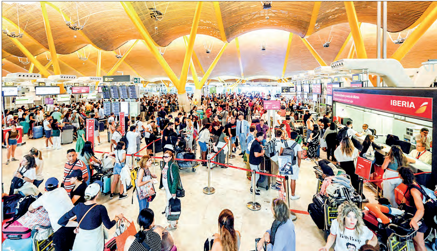
Passengers stand in terminal 4 of Adolfo Suarez Madrid-Barajas Airport in Madrid on 19 July 2024, amid massive global IT outage. Airlines, banks, TV channels and other business across the globe were scrambling to deal with one of the biggest IT crashes in recent years on 19 July 2024 caused by an update to an antivirus program.