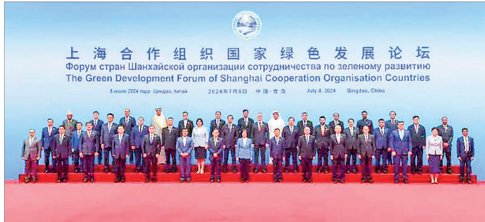
A group documentary photo of special guests, State representatives, and SCO senior officials at the Green Development Forum of SCO Countries in Qingdao.

This common ground fosters a deeper connection. Friends should encourage each other to grow and improve. By cultivating these qualities in friendships, everybody can build lasting and meaningful relationships. It is essential to surround ourselves with friends who inspire and uplift us, helping us navigate life's challenges with grace and resilience.