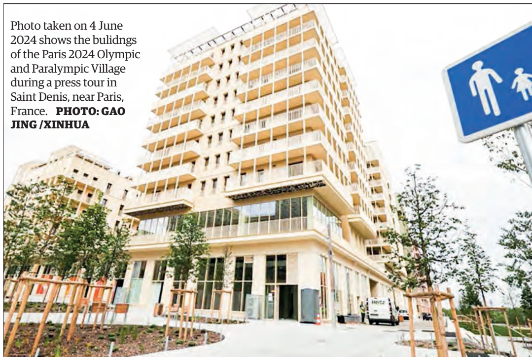
Photo taken on 4 June 2024 shows the buildings of the Paris 2024 Olympic and Paralympic Village during a press tour in Saint Denis, near Paris, France.