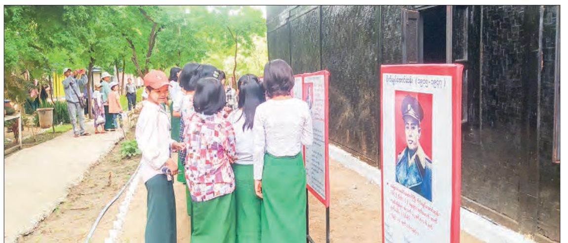
Visitors seen viewing the displays (top and above) at the Bogyoke Aung San residence museum in Natmauk.