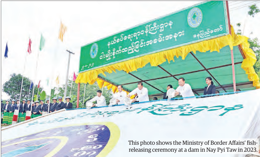
This photo shows the Ministry of Border Affairs' fish-releasing ceremony at a dam in Nay Pyi Taw in 2023.

ACCORDING to the Department of Fisheries, more than 100,000 fingerlings will be produced in regions and states.