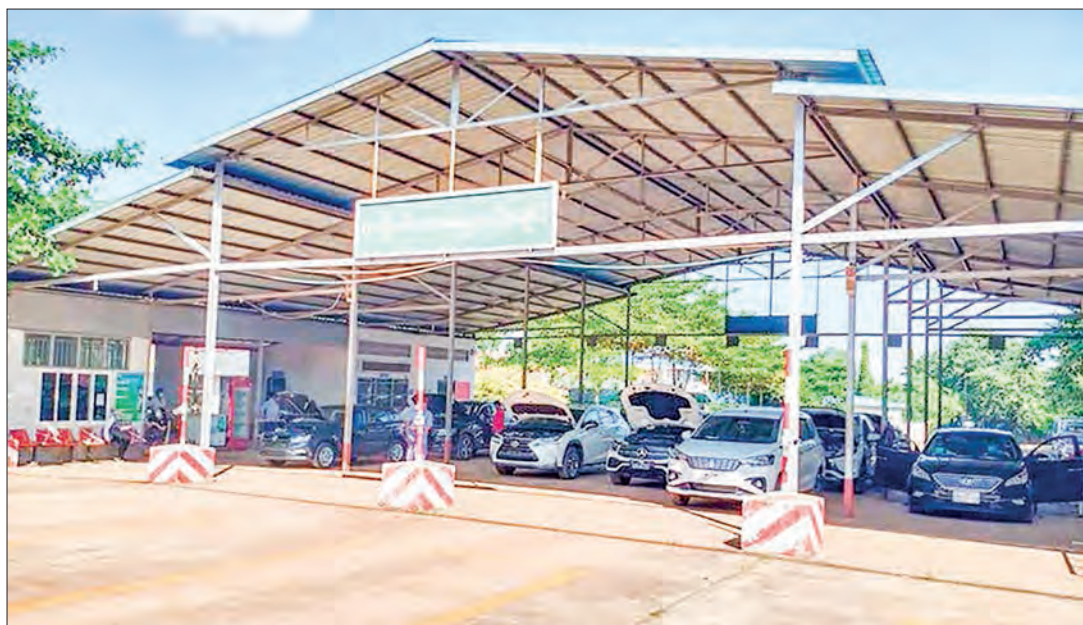
The Vehicle Inspection Section of the Road Transport Administration Department.

THE Road Transport Administration Department (RTAD) released an announcement that safety checks and vehicle inspections must be done prior to renewing registration of taxis, school buses and rental vehicles of above two tonnes.