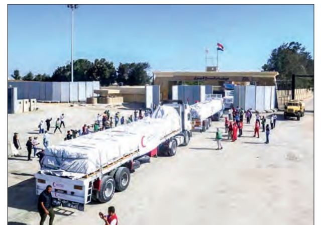
Israeli authorities are considering handing over management of the Rafah border crossing with Egypt, to the European Union Border Assistance Mission to Rafah (EUBAM) and Palestinian officials.

In turn, White House National Security Communications Adviser John Kirby said the Biden administration could not confirm reports that Israel was considering transferring control of the Rafah crossing to the EU and the Palestinians. — SPUTNIK