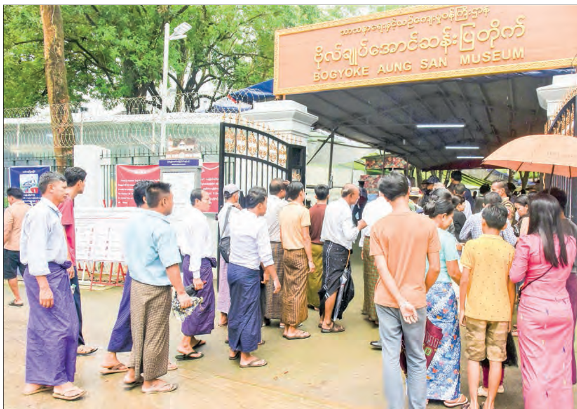
Visitors explore the displays at the Bogyoke Aung San Museum (above and left) yesterday.