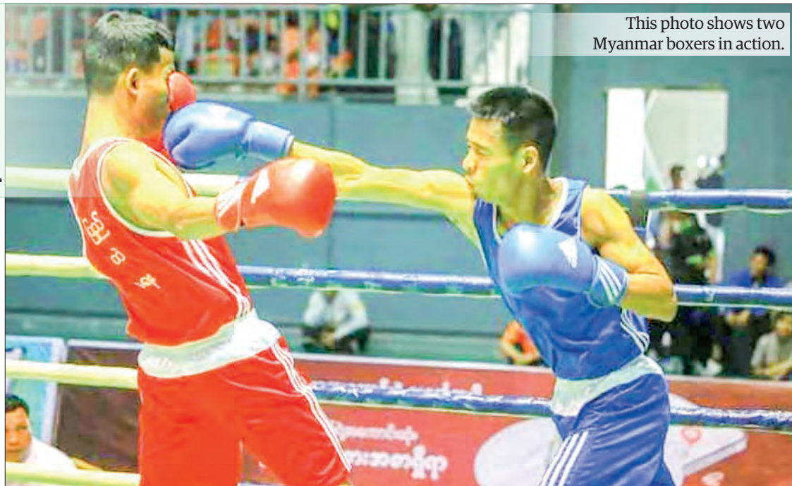
This photo shows two Myanmar boxers in action.

Commission will supervise qualifiers. In the qualifiers, the men will compete in three-minute four rounds and the women in two-minute four rounds. The winners of the qualifiers will be sent to training camps and competitions in Japan. Professional boxers will receive a paycheck based on winning the fight.