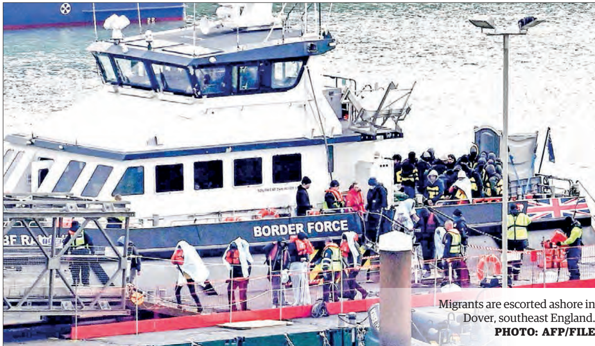
Migrants are escorted ashore in Dover, southeast England.

Hosting 50 European leaders at the fourth EPC meeting signals a united front on migration issues.