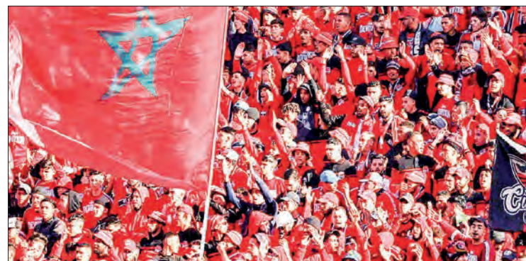
Wydad fans wave flags during the FIFA Club World Cup second round football match between Morocco's Wydad AC and Saudi Arabia's Al-Hilal at the Prince Moulay Abdellah stadium in Rabat on 4 February 2023.

This is mainly due to the fact that Valencia's Mestalla Stadium also needs extensive reforms, but these are unlikely to happen as work has been halted for 15 years on the partially constructed Nou Mestalla ground that is one day intended to be the club's new home. — Xinhua