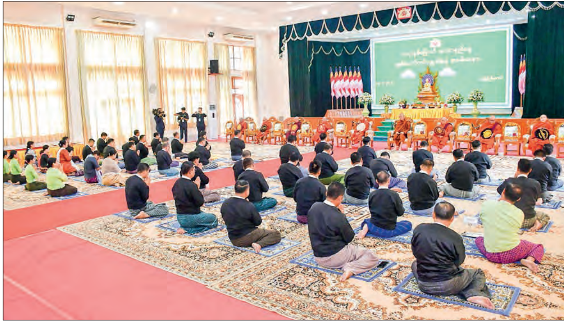
The merit-sharing ceremony to mark the 77 th Anniversary of Martyrs' Day in progress yesterday.

ON the 77 th Anniversary of Martyrs' Day, the ceremony of giving merits to great martyrs who sacrificed their lives for the nation was held yesterday morning at the Zabuthiri Hall of the Nay Pyi Taw Council office in Nay Pyi Taw Union Territory.