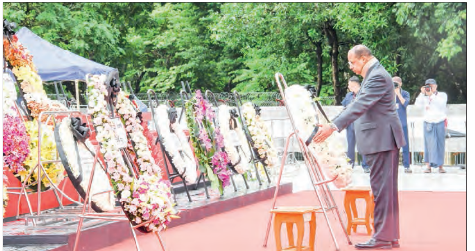
Heads of missions of foreign embassies to Myanmar and charges d'affaires ai lay wreaths at Martyrs' Mausoleum yesterday.