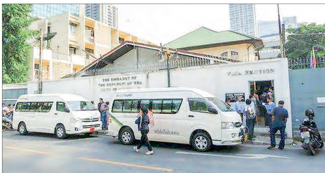
This file photo shows the Myanmar Embassy in Bangkok, Thailand.

Therefore, these employees were urged to report to