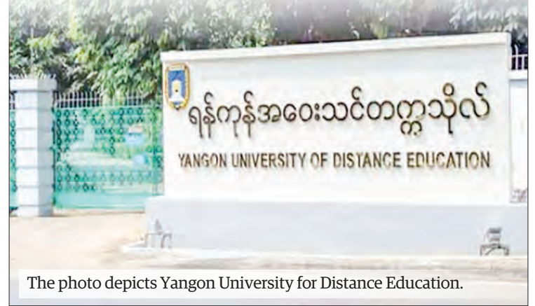
The photo depicts Yangon University for Distance Education.

This two-year programme is provided for a limited number of students and will commence on 1 August. Application forms will be accepted at the department from 22 to 26 July. For further information about the programme, students can contact the university's training supervision committee during office hours. — TWA/TRKM