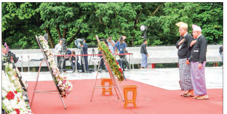
Representatives from civil society organizations lay wreaths at the mausoleum of General Aung San and martyr leaders to pay tributes to them yesterday.