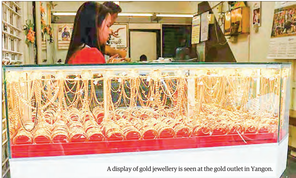
A display of gold jewellery is seen at the gold outlet in Yangon.

FMGEA was asked to supervise relevant tipping-off organizations (gold dealers) to submit TTR and STR to FIU regularly without fail. — NN/KK