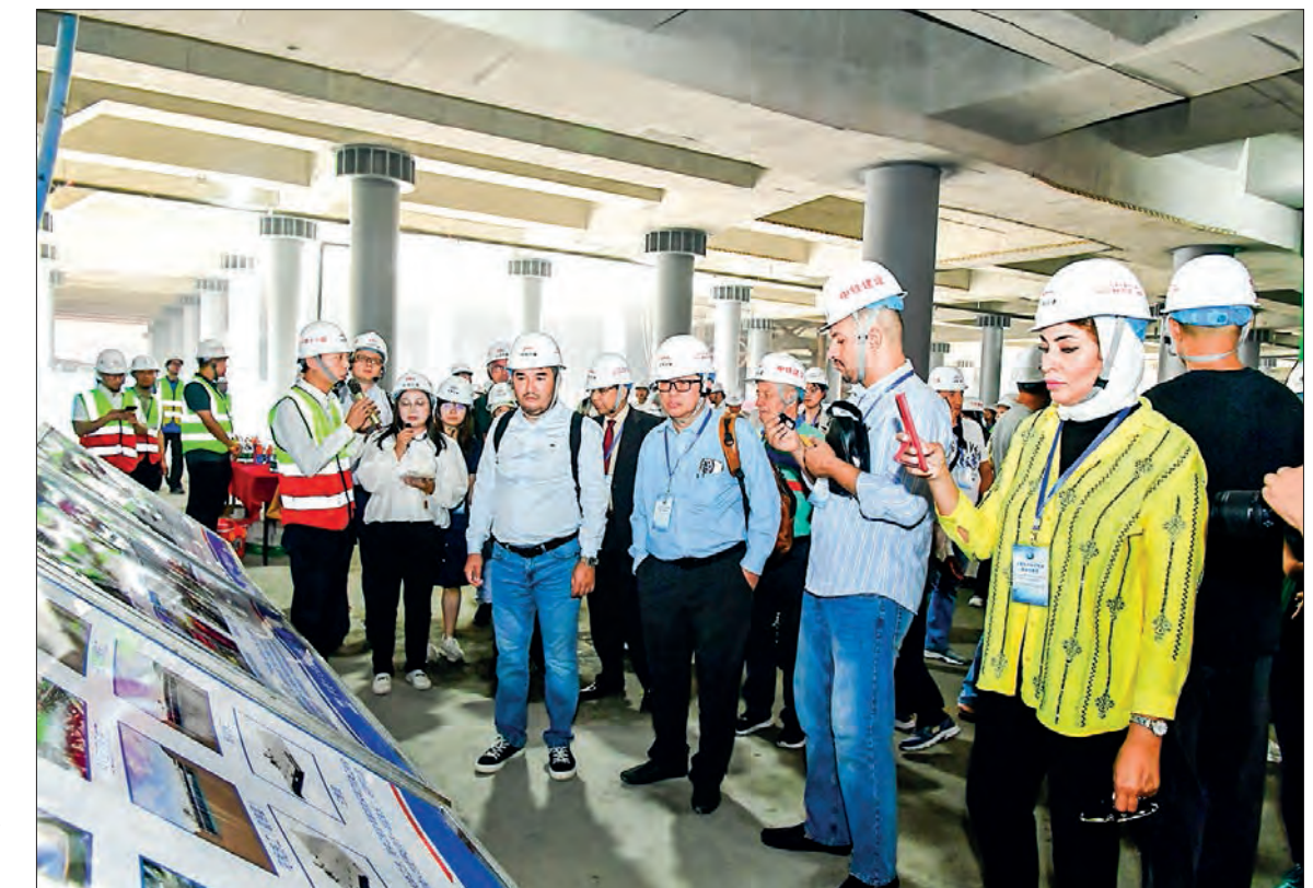
SCO media delegations visit the Comprehensive Transportation Hub in Beijing.

In Beijing, we witnessed the realization of China's ambitious dream of a grand transportation hub in their capital. The Comprehensive Transportation Hub, located in the heart of the city, is now 80 per cent complete. Engineers and workers diligently work to meet the project schedule on time. This monumental project is a testament to China's capabili-