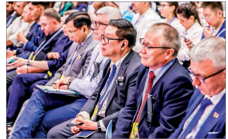
SCO media delegations attending the Green Development Forum in Qingdao.