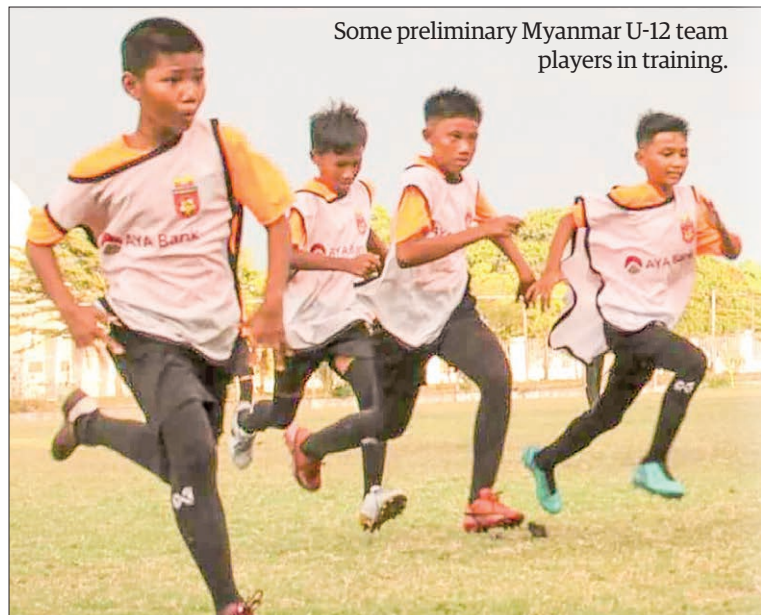
Some preliminary Myanmar U-12 team players in training.

THE preliminary selected Myanmar U-12 team that will take part in the U-12 Junior Soccer World Challenge 2024, a competition that is attracting a lot of interest, is now under training in Mandalay, according to the Myanmar Football Federation.