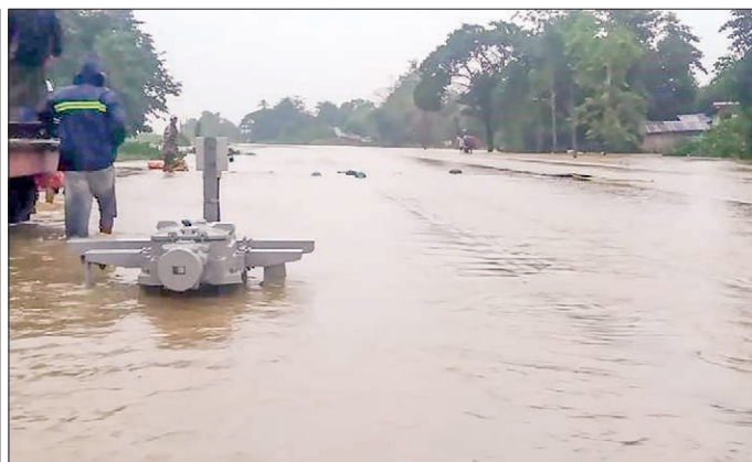
Flood between Bago and Phayagyi stations on the Yangon-Mandalay rail tracks.