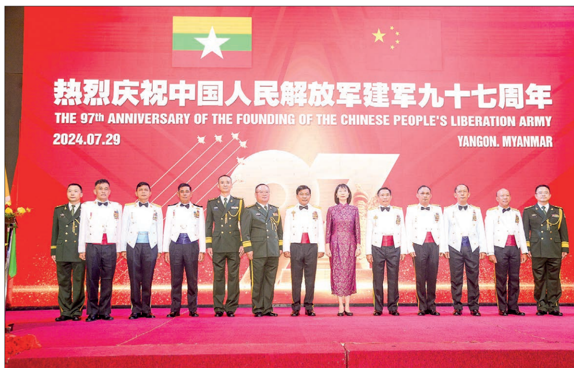
The group documentary picture for the 97 th Anniversary of the Founding of the Chinese People's Liberation Army held yesterday in Yangon.

at Novotel Max Hotel in Yangon yesterday evening.