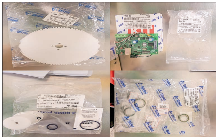
Photos (above) show confiscated illegal goods in different states and regions.

The Illegal Trade Eradication Steering Committee reported that 15 arrests were made on 25, 26 and 28 July, resulting in the seizure of illegal goods worth approximately K552.756 million. — MNA/TMT