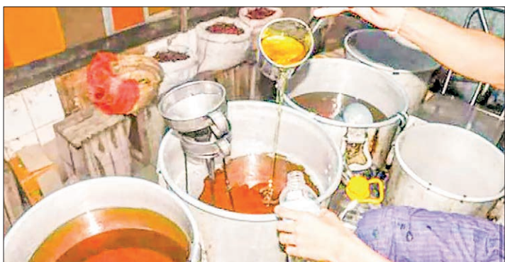
Cooking oil is arranged for sales in the market.

THE wholesale reference rate of palm oil for the Yangon market rose slightly to K5,485 per viss this week ending 4 August from K5,460 recorded last week ending 28 July, according to the Supervisory Committee on edible oil import and distribution.