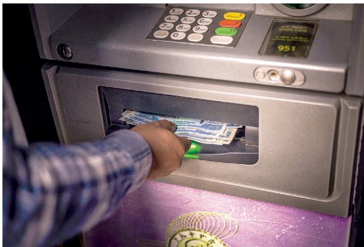
A man withdraws Ethiopian Birr from an ATM in Addis Ababa on 4 December 2023.

ETHIOPIA'S central bank announced on Monday that it was easing curbs on its foreign exchange regime, a move which saw the value of the local currency slide by about 30 per cent.