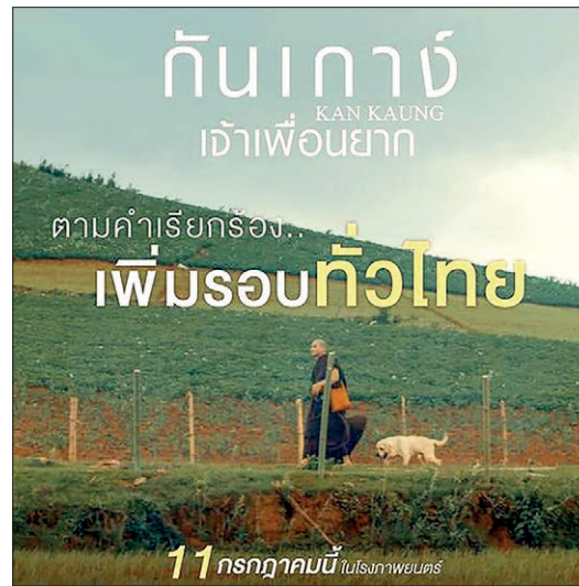
This image showcases a poster of the 'Kan Kaung' film showing in Thailand.

THE Myanmar film 'Kan Kaung' (Lucky) won the Best Producer Award, Best Director Award, and Best Actor Award at the SEA International Film Festival 2024, according to Academy