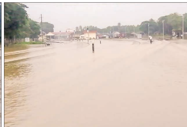
Flood in the Bago-Kali rail section.