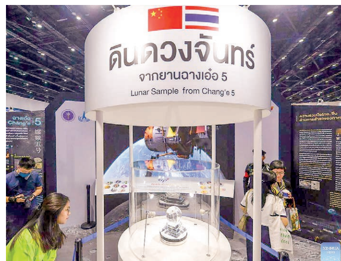
People view the lunar sample from China's Chang'e-5 mission during the Sci Power for Future Thailand Fair in Bangkok, Thailand, 23 July 2024.

A rare opportunity to see soil from the moon in person captivated crowds as the lunar sample from China's Chang'e-5