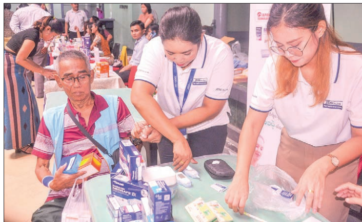
Direct medication sale in progress in Yangon.

THE pharmaceutical companies organized medicine sales at three designated sites in Yangon and Bago regions under the guidance and leadership of the Ministry of Commerce, Yangon Region Government and the Myanmar Pharmaceutical and Medical Equipment Entrepreneurs Association.