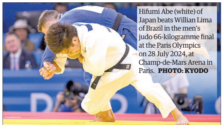
Hifumi Abe (white) of Japan beats Willian Lima of Brazil in the men's judo 66-kilogramme final at the Paris Olympics on 28 July 2024, at Champ-de-Mars Arena in Paris.

Hifumi's win gave his country its second judo gold of the Paris Games, following Natsumi Tsunoda's triumph in the women's 48-kg category the previous day.