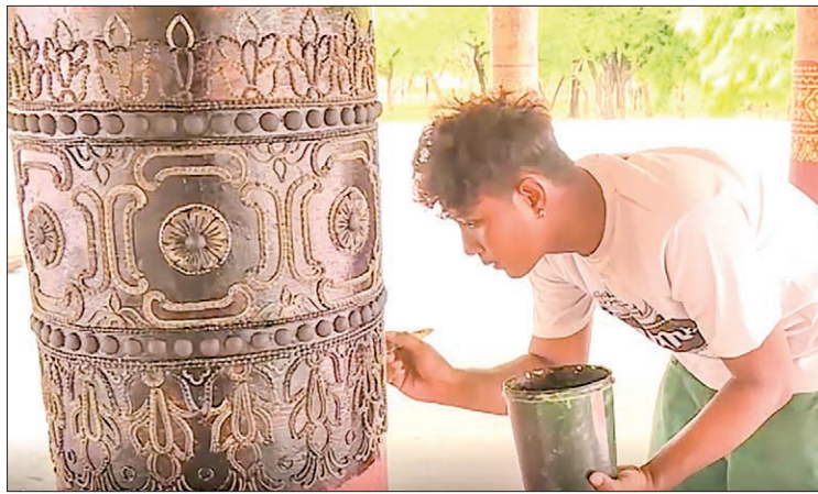
Workers are painting the pillars with a lacquer gold coating.