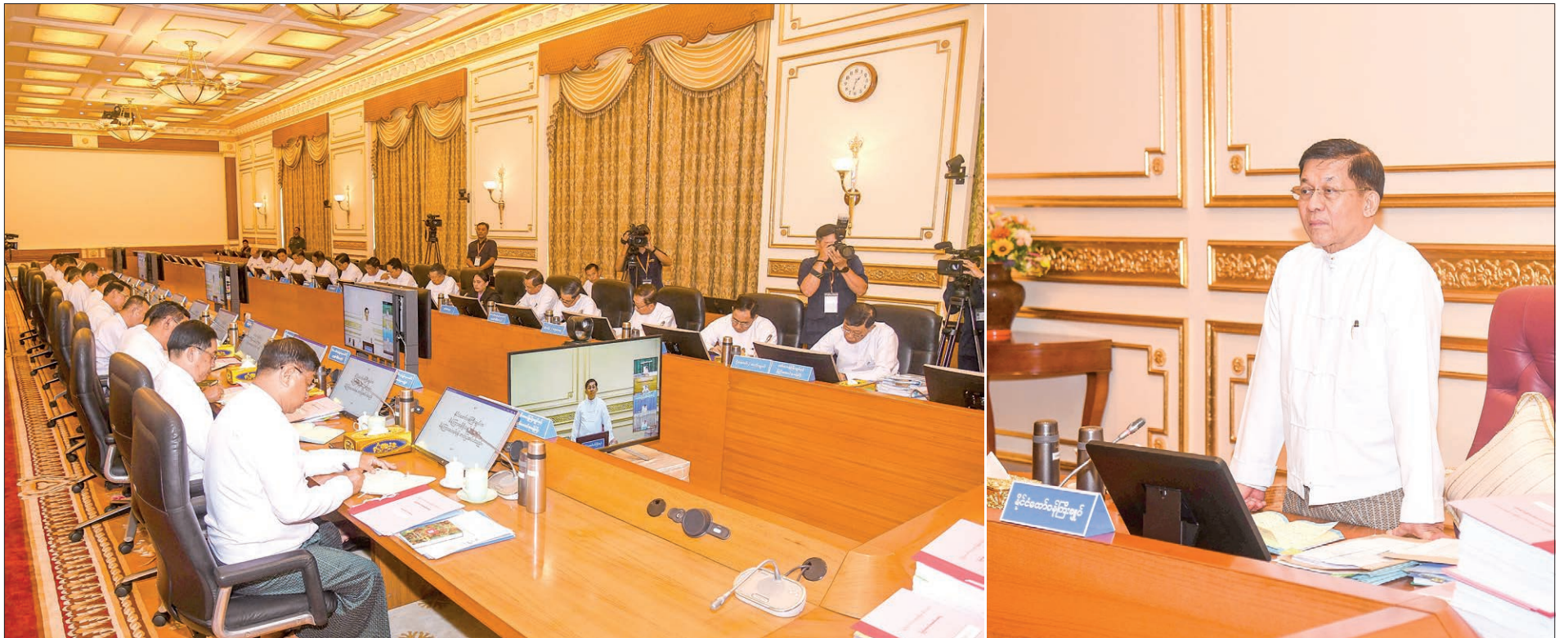
State Administration Council Chairman Prime Minister Senior General Min Aung Hlaing addresses the sixth Union government meeting yesterday in Nay Pyi Taw.