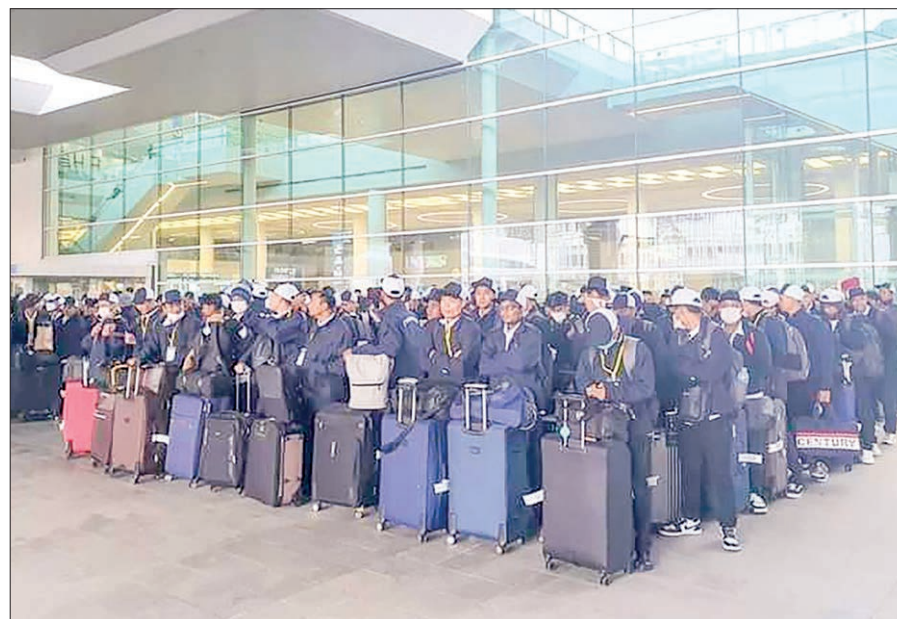
This photo shows Myanmar workers who were sent under EPS to the Republic of Korea in 2023.

application are original passport and its colour copy, three passport sized photos (white background, good quality, 3.5 cm x 4.5 cm), original medical check-up, copy of citizenship scrutiny card, own bank account opened in a public/private bank under the same name as stated in the passport, copy of household register, copy of education qualification, and whether or not you have been to Korea and, if yes, job type and sector in the