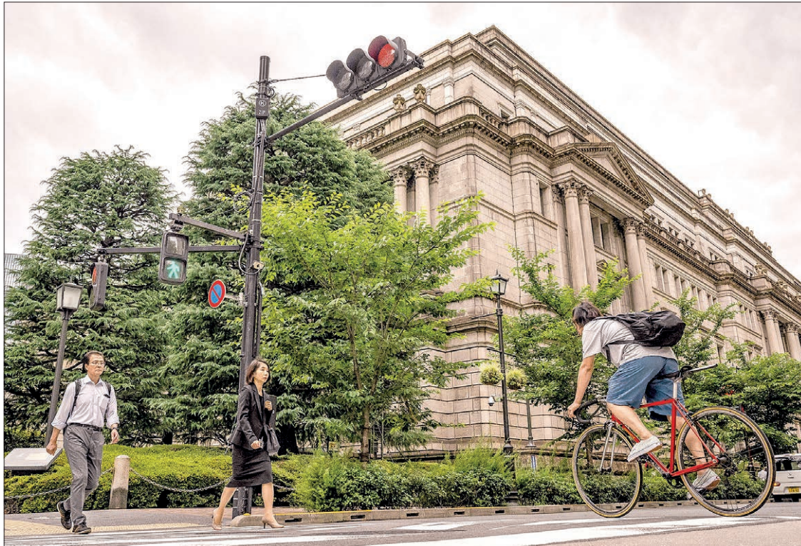
People walk past the Bank of Japan (BoJ) headquarters in Tokyo on 13 June 2024.

The reading, which was just above officials' two per cent target, was the latest to boost bets on a rate cut in September and pushed up expectations for two more before January.