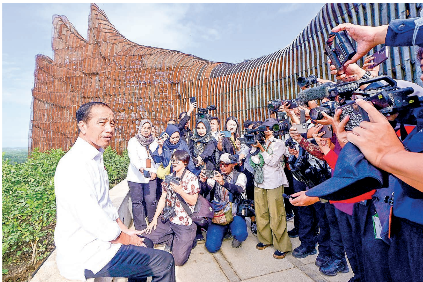
This handout picture taken and released on 29 July 2024 by the Indonesian Presidential Palace shows Indonesia's President Joko Widodo (L) speaking to the media as he visits the new Presidential Palace in the future capital city of Nusantara (IKN) in Penajam Paser Utara, East Kalimantan.