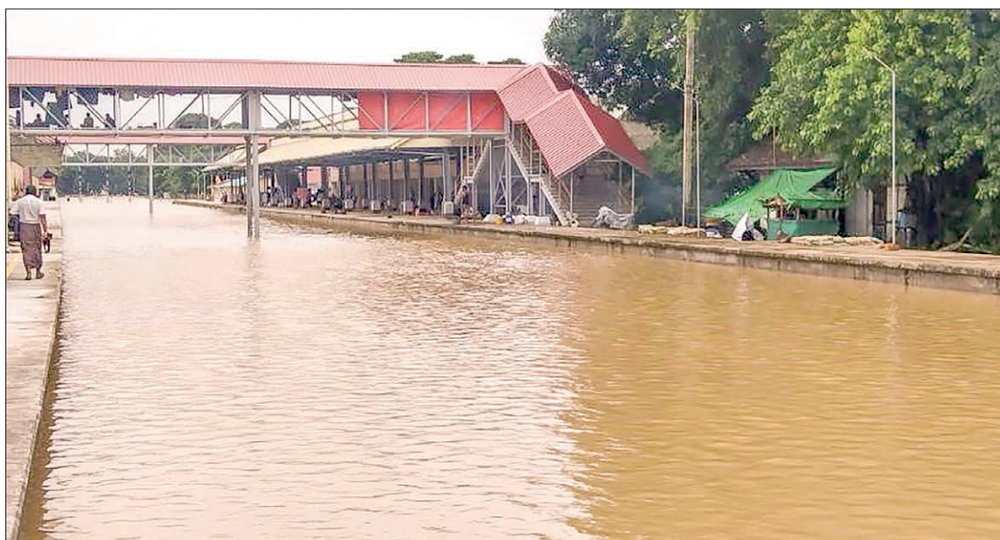
Flood in Bago Station's courtyard on the Yangon-Mandalay railways.

Due to water levels exceeding nine inches above the surface of the railroads and bridges, Myanma Railways had to arrange alternative trans-