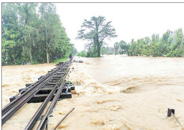
Flood in the Pathein-Hinthada-Kyangin railroad between Mezaligon and Htoogyi stations.

transferred to Mandalay via the No 12 Down train. Similarly,