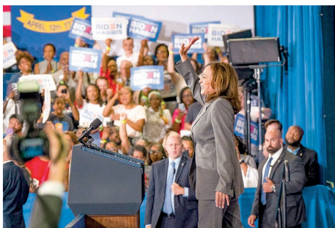
US Vice President Kamala Harris waves during a campaign event at James B Dudley High School on 11 July 2024 in Greensboro, North Carolina. Harris spoke on the stakes of the election for North Carolinians.

A new Wall Street Journal poll showed Harris had closed Biden's six-point deficit with Trump to just two points — well within the margin of er-