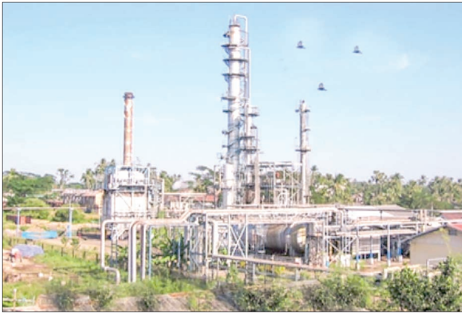
No 1 Oil Refinery (Thanlyin).

Additionally, measures must be taken to minimize any environmental and socioeconomic impacts resulting from the refinery's operation. Necessary courses and seminars should be organized to ensure that current factory employees are proficient not only in manufacturing but also in statistics and management. — TWA/TKO