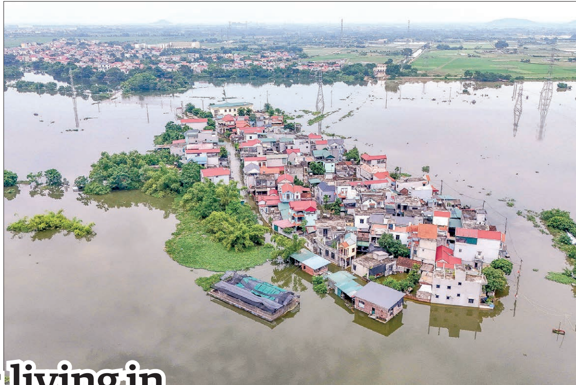
An aerial picture shows flood waters surrounding and submerging homes in Ben Voi village on the outskirts of Hanoi on 28 July 2024. Hundreds of people in the suburbs of Hanoi have been living in floodwater for a week after torrential rain in northern Vietnam caused rivers to overflow their banks.

“I cannot go anywhere, and neighbours are finding it difficult to come to my shop to buy things,” Tran Thi Ly, who runs a convenience store from the ground floor of her home, told