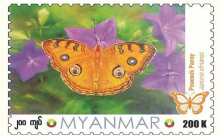
A new postage stamp in peacock pansy (K200).

The information, contact phone numbers, and certificates to be filled in or attached to the job application must be accurate, and if any of them are incorrect, it is the responsibility of the applicant, and there is no guarantee that everyone who submits a job application will be able to work in the Republic of Korea, the department said. — MT/ZN