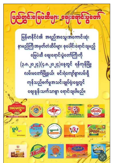
This picture captures an advertisement for the peanut oil market fair.

Currently, in the external market, the price of peanut oil without packing is K19,000 per