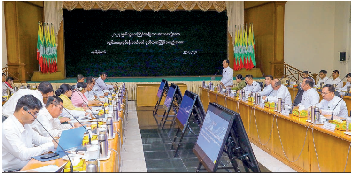
The second coordination meeting of the Working Committee on Organizing the Fifth National Sports Festival 2024 in progress yesterday in Nay Pyi Taw.

Speaking at the event, the Union Sports and Youth Affairs Minister said there would be six