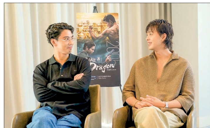
Japanese actors Ryoma Takeuchi (R) and Kento Kaku (L) speak during an interview for Amazon Prime Video's "Like a Dragon: Yakuza" on the sideline of Comic Con International in San Diego, California, 27 July 2024.