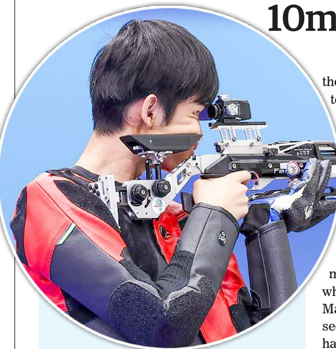
Sheng Lihao of China competes during the 10-metre air rifle men's final of shooting at the Paris 2024 Olympic Games in Chateauroux, France, on 29 July 2024.

CHINESE marksman Sheng Lihao claimed the Paris Olympic title in the men's 10-metre air rifle event on Monday, adding to his victory in the 10m air rifle mixed team event along with Huang Yuting.