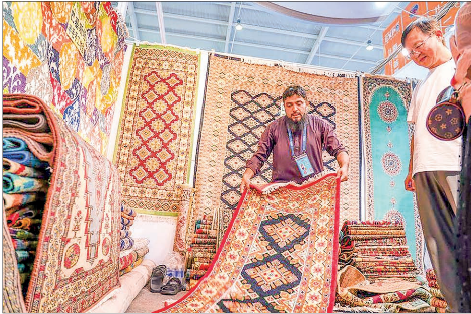
A Pakistani exhibitor (L) introduces carpets to visitors at the South Asia Pavilion during the Eight China-South Asia Expo in Kunming, southwest China's Yunnan Province, 26 July 2024.