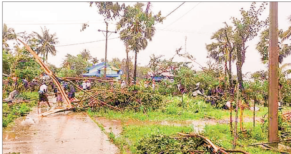
This photo shows some houses being damaged by a tornado in Kungyangon Township.

"According to residents, the tornado lasted just two or three minutes. It swept like this within the moment. Thirty-four houses collapsed completely, and the roofs of 37 houses were damaged. More than 300