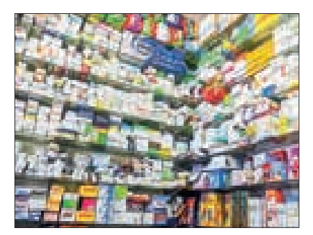
CBM sells US$5.4M to fertilizer, edible oil, and pharmaceutical importers on 3 July