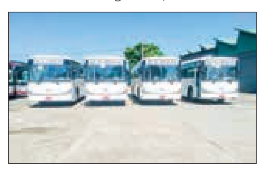
A bus line runs from Bago to Yangon

Bus lines will start to run after the construction is finished. Passengers can come to take buses at Aung Mingala and about 20 to 30 buses will be provided on a daily basis. Bus fare from Bago to Yangon's Aung Mingala Terminal is set at K3,000 by the consent of bus lines, and action will be taken if it charges more, he said. — MT/ZS