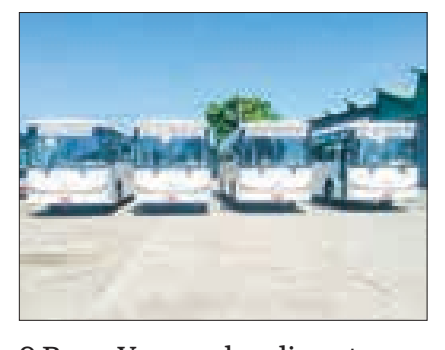
9 Bago-Yangon bus lines to relocate to Aung Mingala Terminal