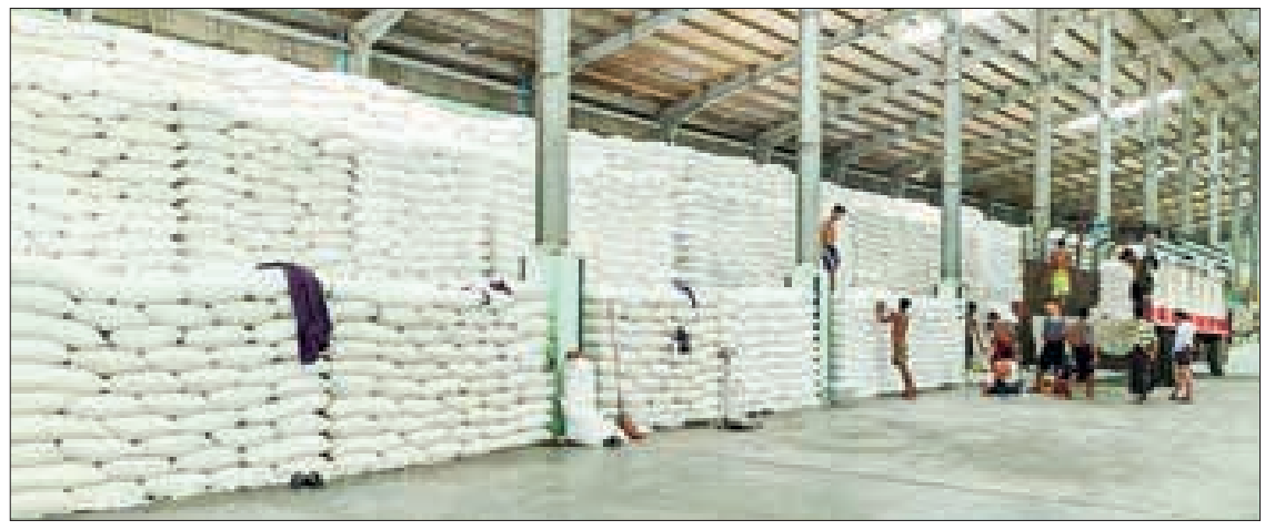
Workers meticulously organize rice bags in a warehouse.

The MRF announced that the warehouse operators and wholesalers need to seek registration on Myanmar Rice Online (MyRO) through www. myro.com.mm for procurement of more than 5,000 baskets of paddy and over 50 tonnes of rice. The registered warehouse owners are notified through SMS to update their monthly reports within the first seven days of every month.