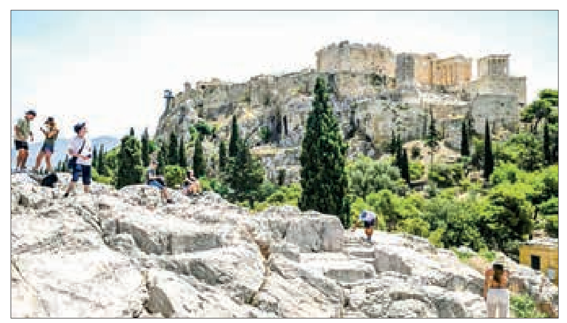
The Acropolis is offering private visits for 5,000 euros, prompting protests from the site's guards.

This initiative allows groups of up to five people exclusive access outside of normal visiting hours, aiming to provide a more intimate and personalized experience of the ancient monument.