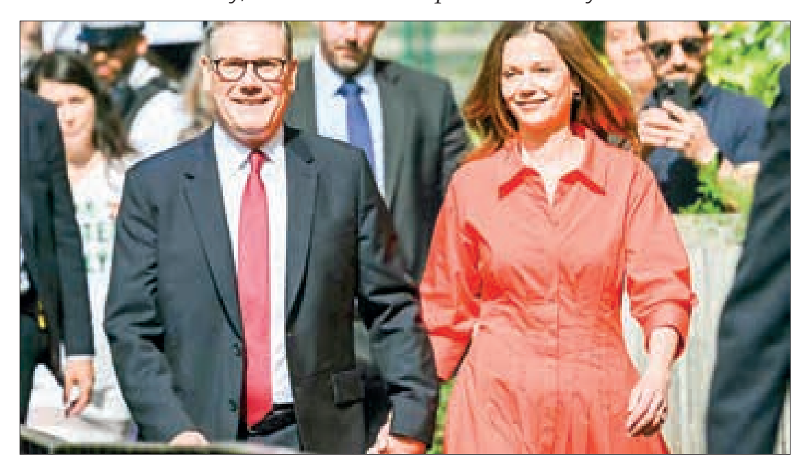
Britain's opposition Labour Party leader Keir Starmer and his wife Victoria arrive to cast their votes. PHOTO:

Leading up to the election, pre-election polls indicated a substantial 20-point lead for the main opposition Labour Party over the Conservative Party, which has held power for 14 years.