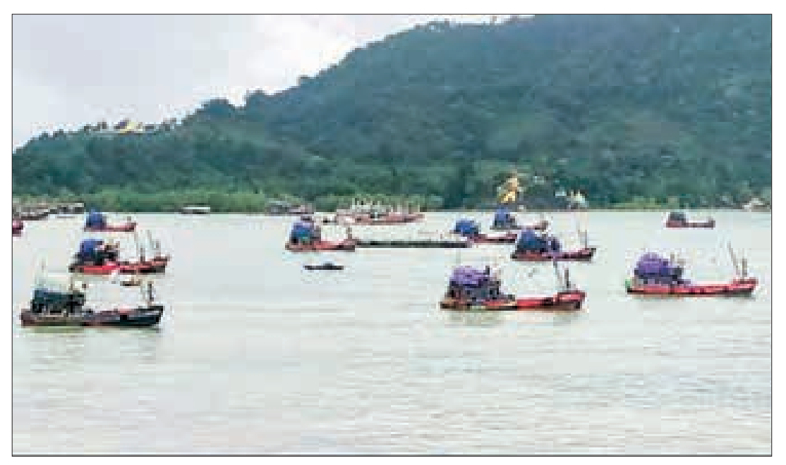
Fishing boats are seen in the Myanmar Waters.

ACCORDING to the Department of Fisheries, after a threemonth suspension of fishing permits for the spawning season, fishing permits have been re-authorized this July.