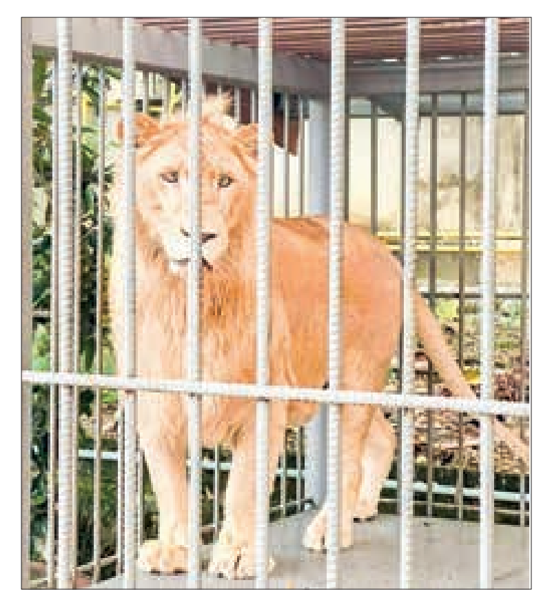
This photo shows an African lion (male) being confiscated in Tachilek.

The chief executive officer of the Htoo Zoos and Gardens Business Unit, in collaboration with the Myanma Timber Enterprise, transported wild animals to the Zoo and Safari Park in Nay Pyi Taw for public display, according to the Ministry of Natural Resources and Environmental Conservation. — TWA/TMT