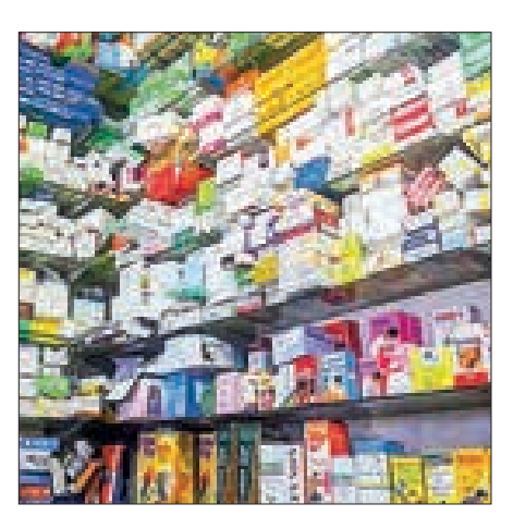
Various medications seen being displayed at a pharmacy outlet.

According to CBM's notification on 15 March, it has been joining hands with law enforcement agencies to combat and prosecute those who attempt to manipulate the currency market under the existing laws. CBM allowed authorized