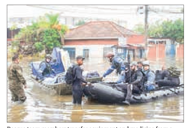
Rescue team members transfer equipment and medicine from a flooded hospital in Canoas, Rio Grande do Sul state, Brazil, 10 May 2024.

The flooding, which began on 29 April after torrential rains persisted for days, affected 2,398,255 inhabitants across 478 towns, including Porto Alegre, the state capital. More than 450,000 people were evacuated during the peak of the storms.