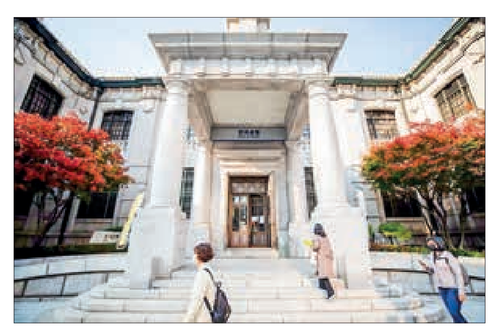
Pedestrians are seen in front of the Bank of Korea (BOK) in Seoul, South Korea, on 24 November 2022.

Financial liabilities declined 7.8 trillion won ($5.6 billion) in the first