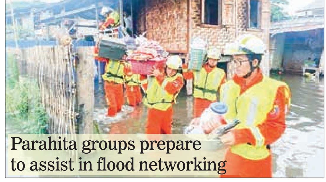
A Parahita group helps in evacuating flood-affected people in Myitkyina.

THROUGH networking, Parahita groups are working to provide help and rescue if floods continue in Myanmar.