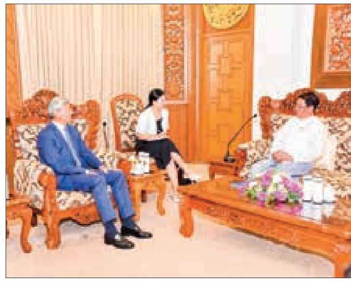
Chinese Ambassador Mr Chen Hai calls on Deputy Prime Minister MoFA Union Minister U Than Swe yesterday.

DEPUTY Prime Minister of the Union of Myanmar U and Union Minister for For- Than Swe received Mr Chen acceleration of Myanmar-Chieign Affairs of the Republic Hai, Ambassador Extraordina bilateral relations. — MNA