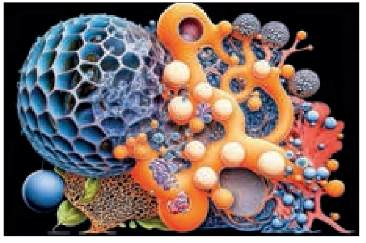
This advancement underscores the potential of AI in personalized medicine, facilitating more effective and efficient treatment decisions for cancer patients. Blood cells play a crucial role in the body's immune response, which is particularly vital in combating diseases like cancer.