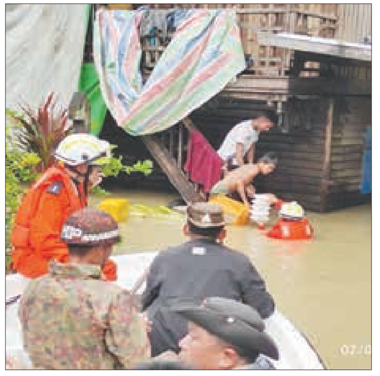
Rescue and relief measures underway in Khamti Township.

Officials also donated rice and daily food to the monks and nuns from the monastery and nunnery in Pawmai Ward and are carrying out relief work.