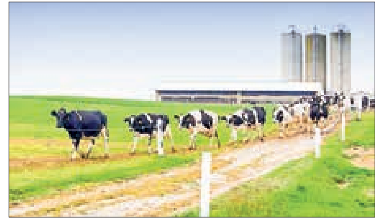
This latest case follows earlier infections in Texas and Michigan. PHOTO: PIX FOR VISUAL PURPOSE/ PKVESTA

Experts are concerned about the growing number of mammals infected with the disease, although cases in humans remain rare. — AFP