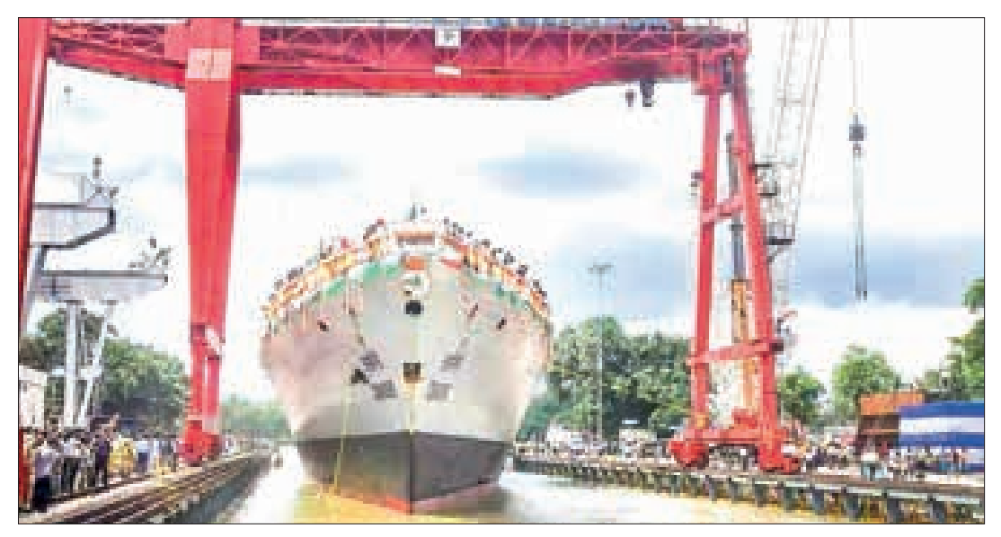
The recent performance of GRSE's stock is indicative of investor confidence in India's defence capabilities and export potential under the current policy framework.

GRSE, a prominent Indian shipbuilding company, has seen its stock price increase dramatically.