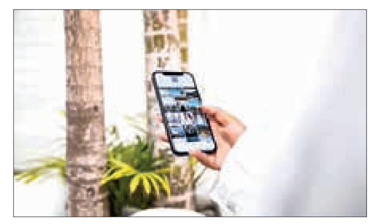
Threads, Meta's response to X (formerly Twitter), has swiftly gained traction in the social media landscape, amassing 175 million monthly users within a year of its surprise launch.

the amount of posts on X for non-subscribers.