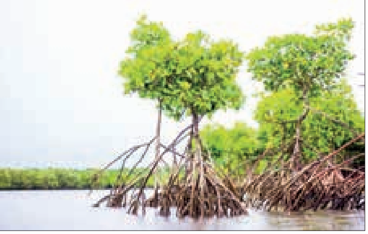
Photos (L & R) show officials inspecting a mangrove forest and its surroundings in a coastal area of Yangon Region.

ACCORDING to the Ministry of Natural Resources and Environmental Conservation, seven protected public mangrove forests have been established